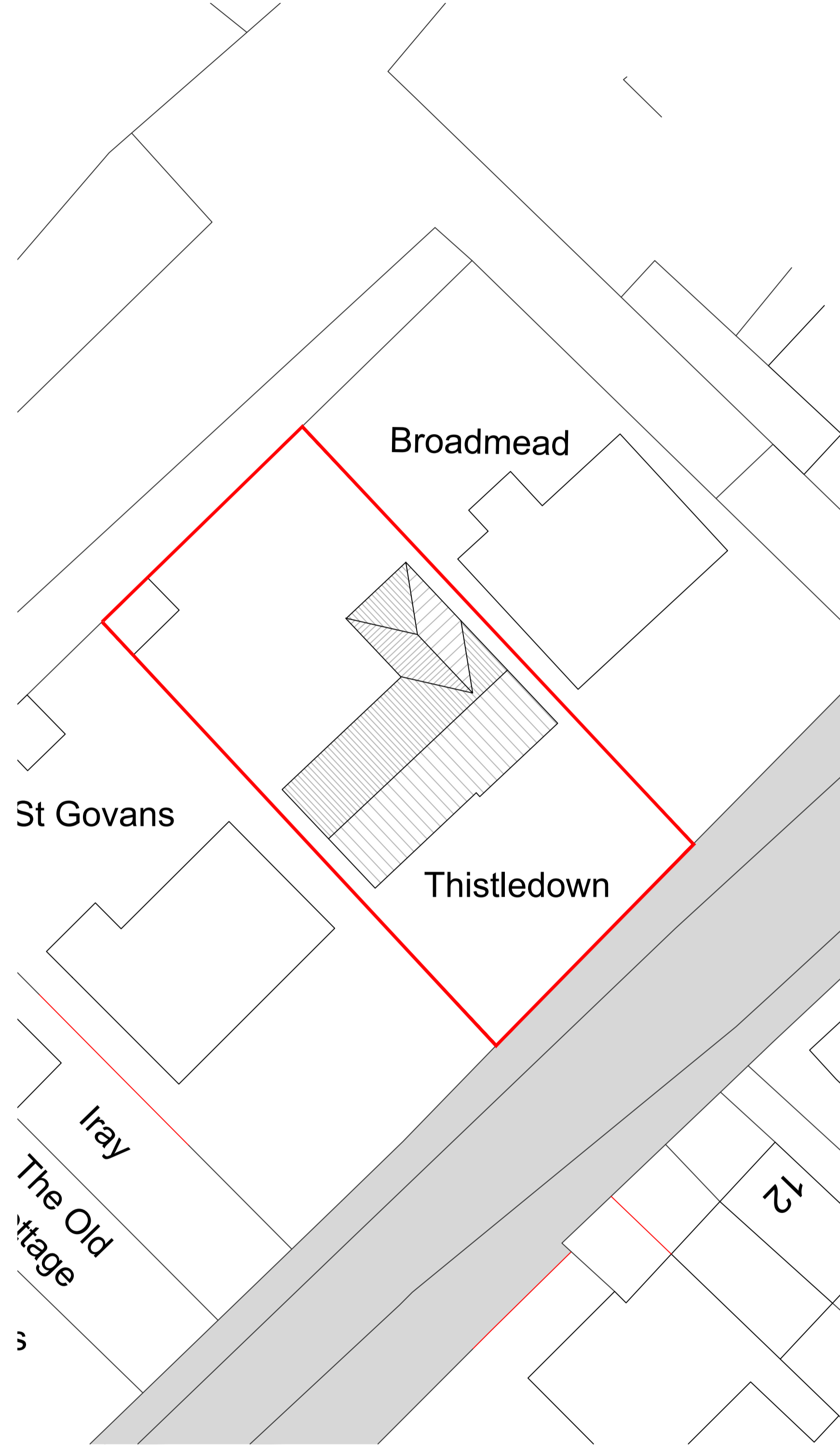
3 SITE PLAN- EXISTING A-100 SCALE 1:200 @A1 1:200 0m 2 4 8 1 3 6 10 n