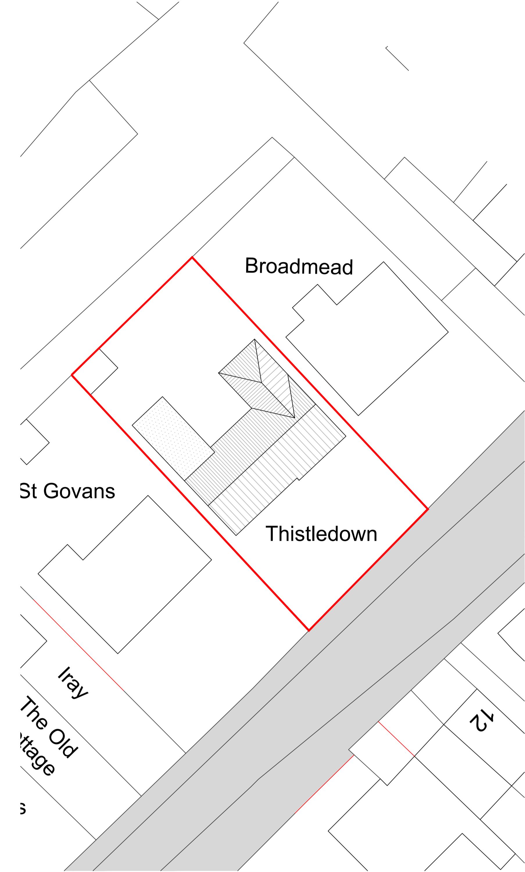
4 SITE PLAN- PROPOSED A-100 SCALE 1:200 @A1 1:200 0m 2 4 8 1 3 6 10 n

revisions REV A 26/09/22 - Note added - 'existing block plan'