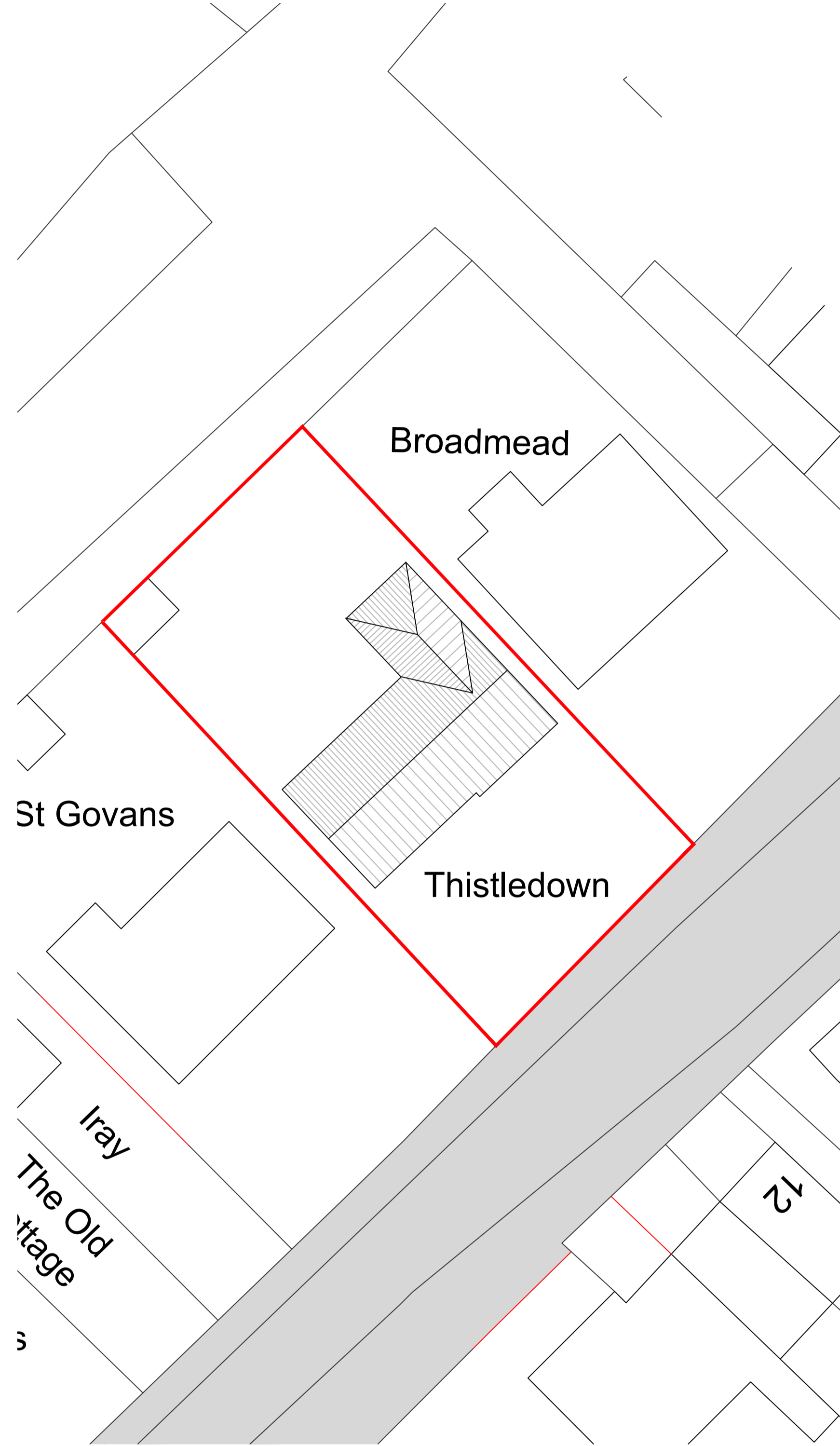
3 SITE PLAN- EXISTING A-100 SCALE 1:200 @A1