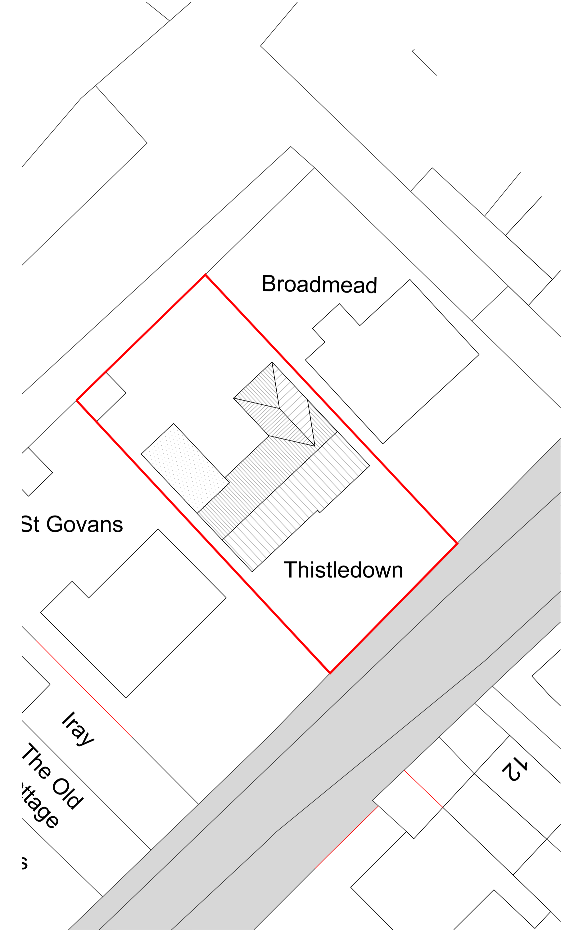
4 SITE PLAN- PROPOSED A-100 SCALE 1:200 @A1

revisions REV X XXXXXX - MINOR AMENDMENTS