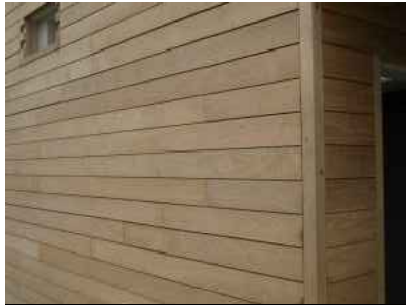
PICTURE 2 Example of Oak cladding