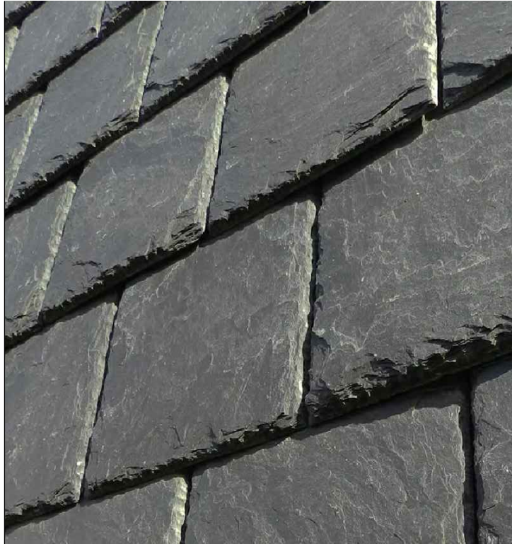
PICTURE 1 Example of Spanish slate roof tiles