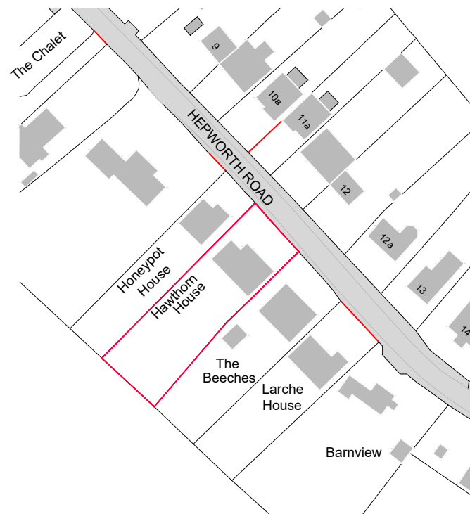
SITE LOCATION PLAN 1:1500 @ A3