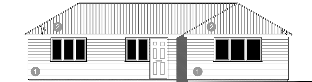
01 AS PROPOSED FRONT ELEVATION 1:100 @ A3