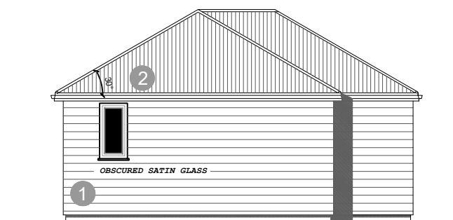
04 AS PROPOSED SIDE ELEVATION 1:100 @ A3

do not scale from this drawing check all dimensions on site before construction