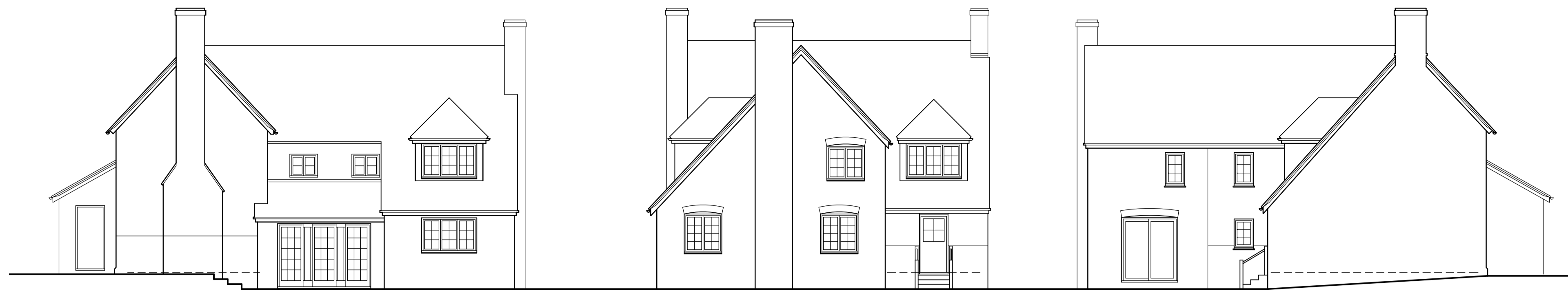
EXISTING SIDE ELEVATION SCALE 1:100 @A1 0 1 2 3 4m