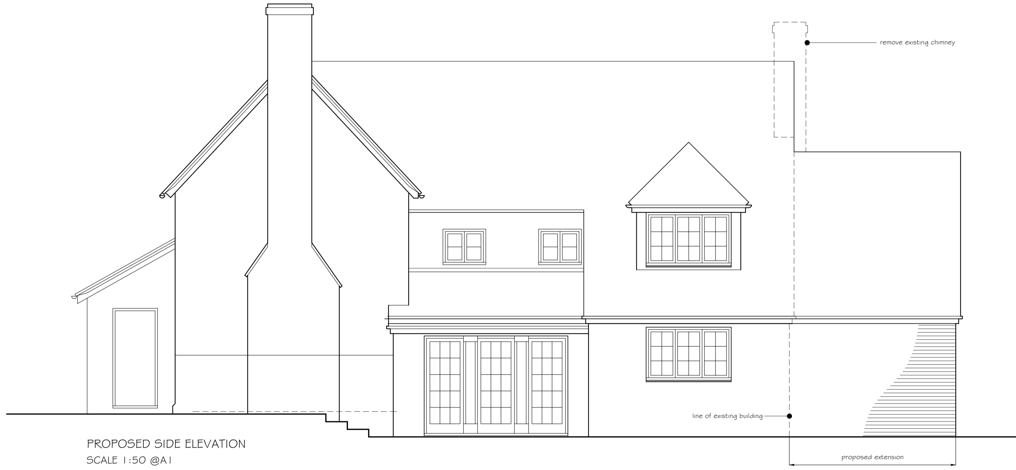
PROPOSED SIDE ELEVATION SCALE 1:50 @A1 0 1 2 3 4m