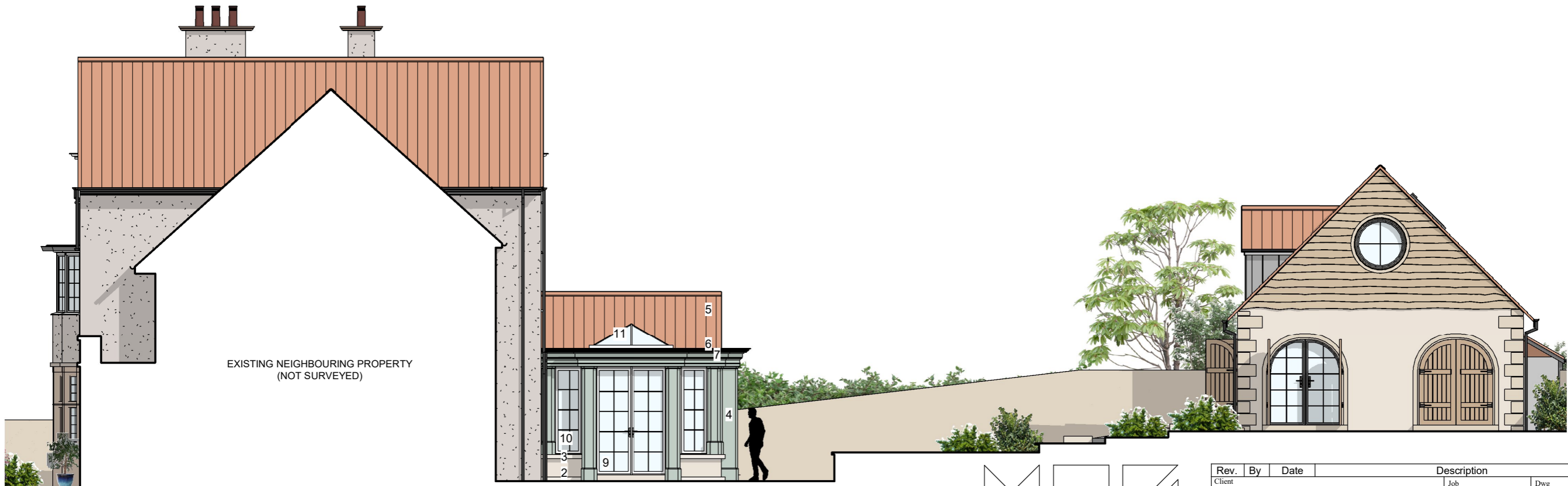
PROPOSED NORTH (SIDE) ELEVATION