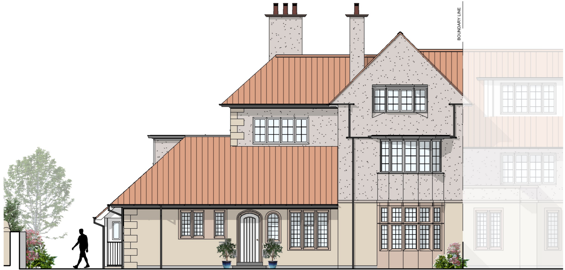
PROPOSED EAST (FRONT) ELEVATION