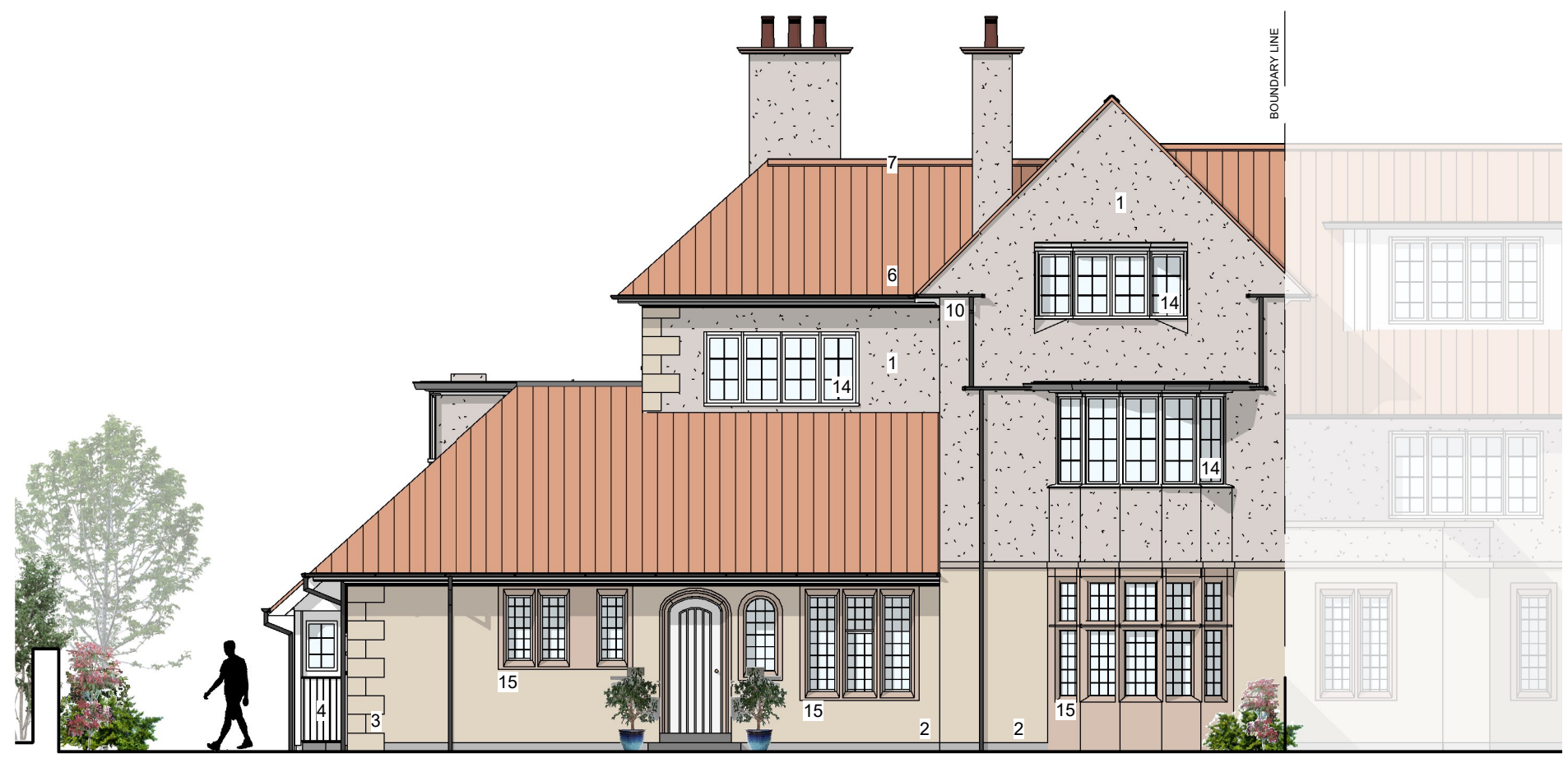
EXISTING EAST (FRONT) ELEVATION