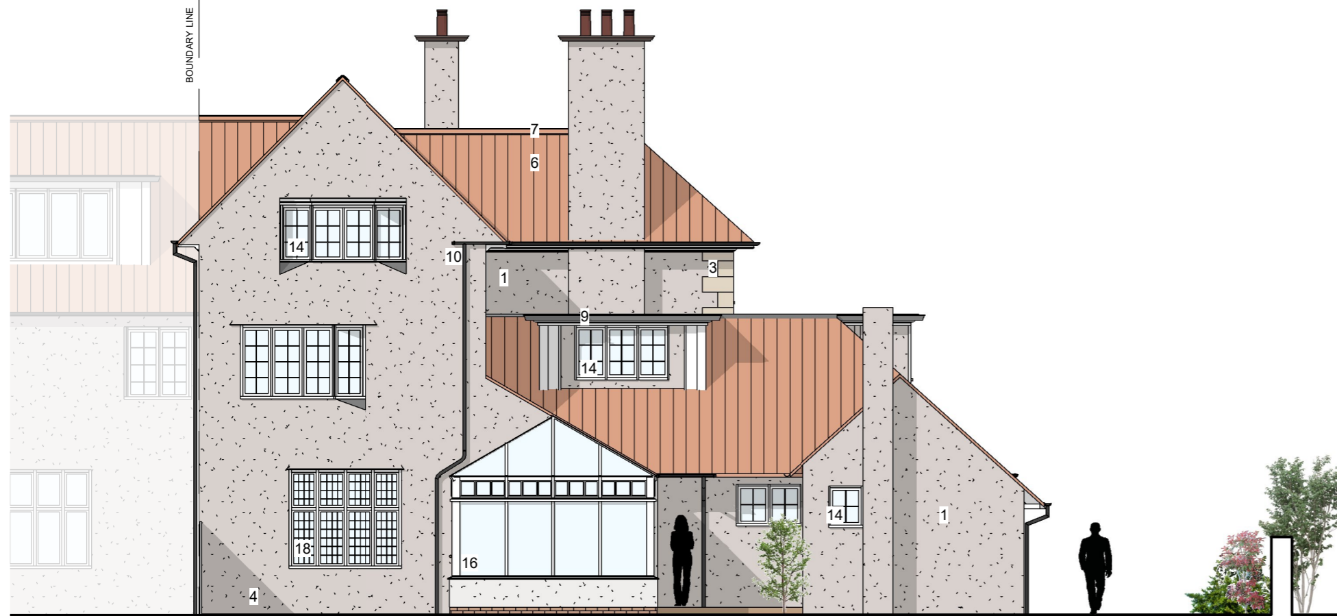
EXISTING WEST (REAR) ELEVATION