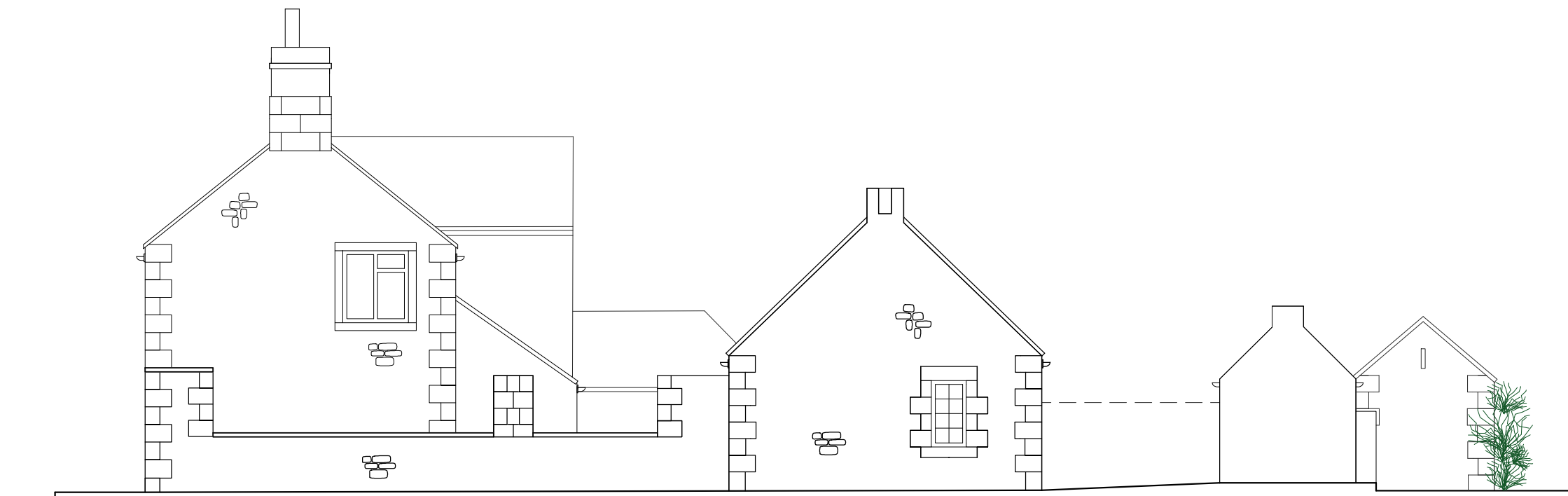
Existing South Elevation Foliage in foreground omitted for clarity.