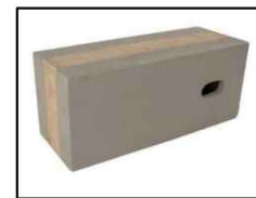
2 No. to be installed. Marked Position (B)