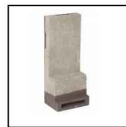
2 No. to be installed. Marked Position (A)