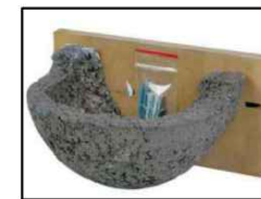
4 No. to be installed. Marked Position (C) (UNDER ARCHWAY)