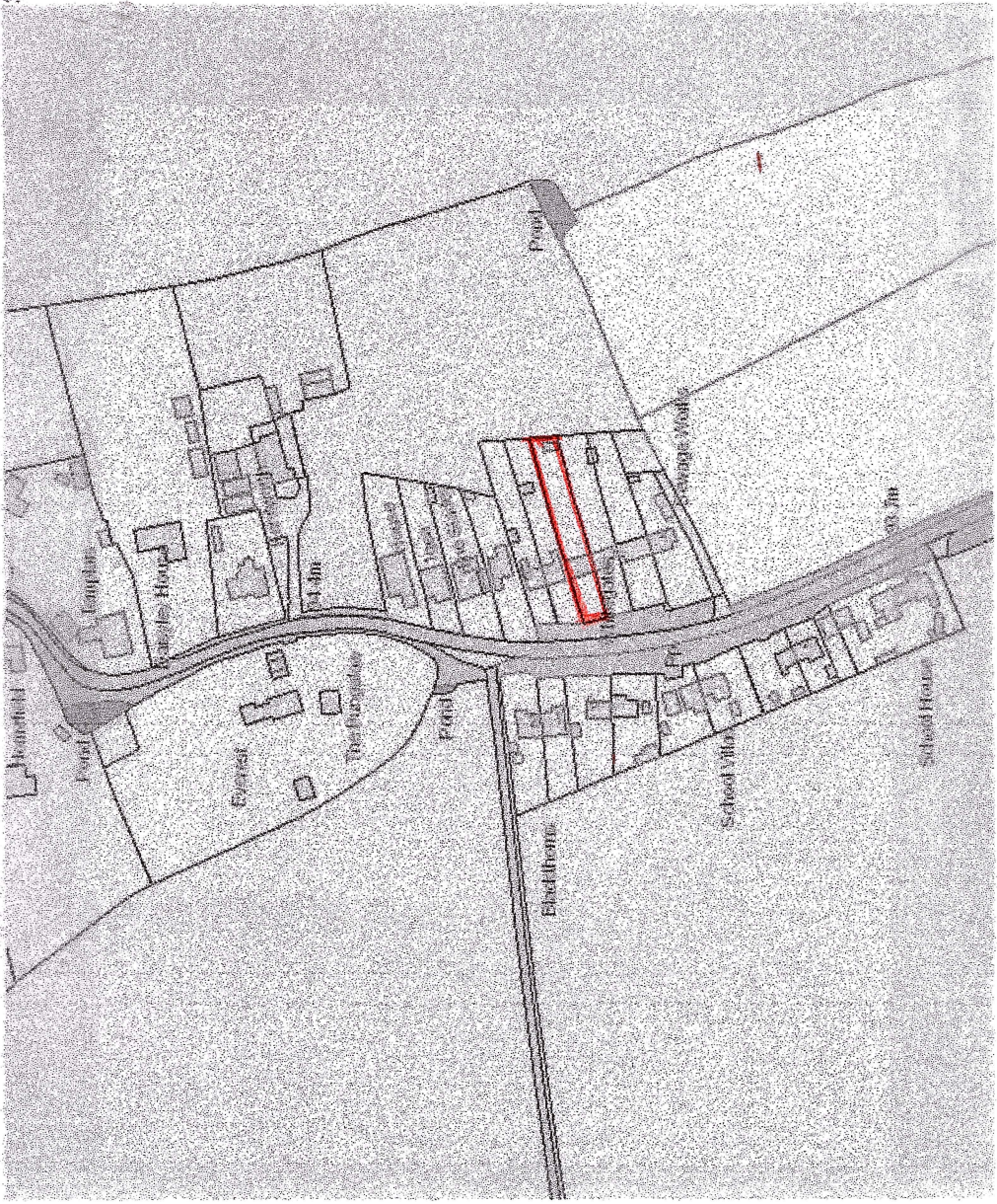
LOCATION PLAN 1:2500