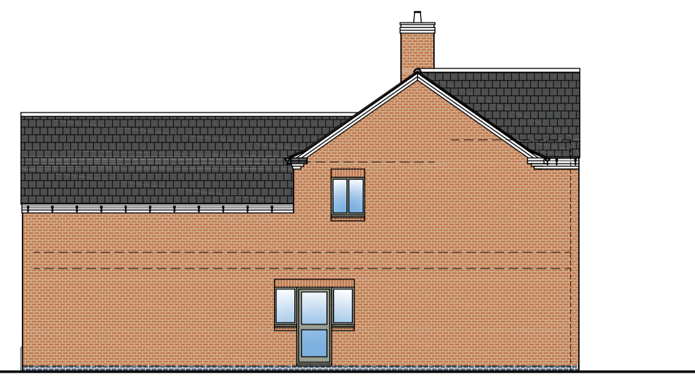
PROPOSED SIDE ELEVATION 1/100