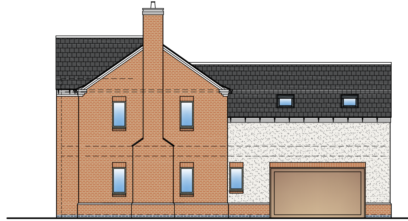
PROPOSED SIDE ELEVATION 1/100