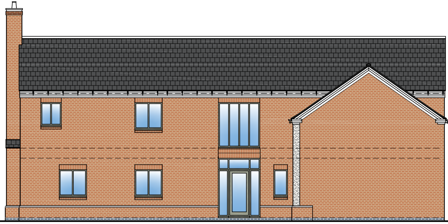
PROPOSED FRONT ELEVATION 1/100