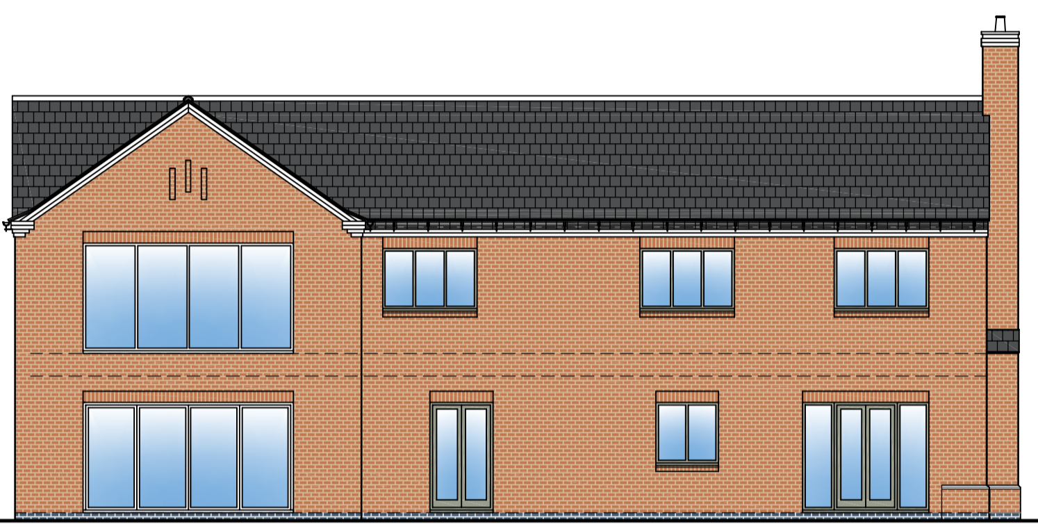
PROPOSED REAR ELEVATION 1/100