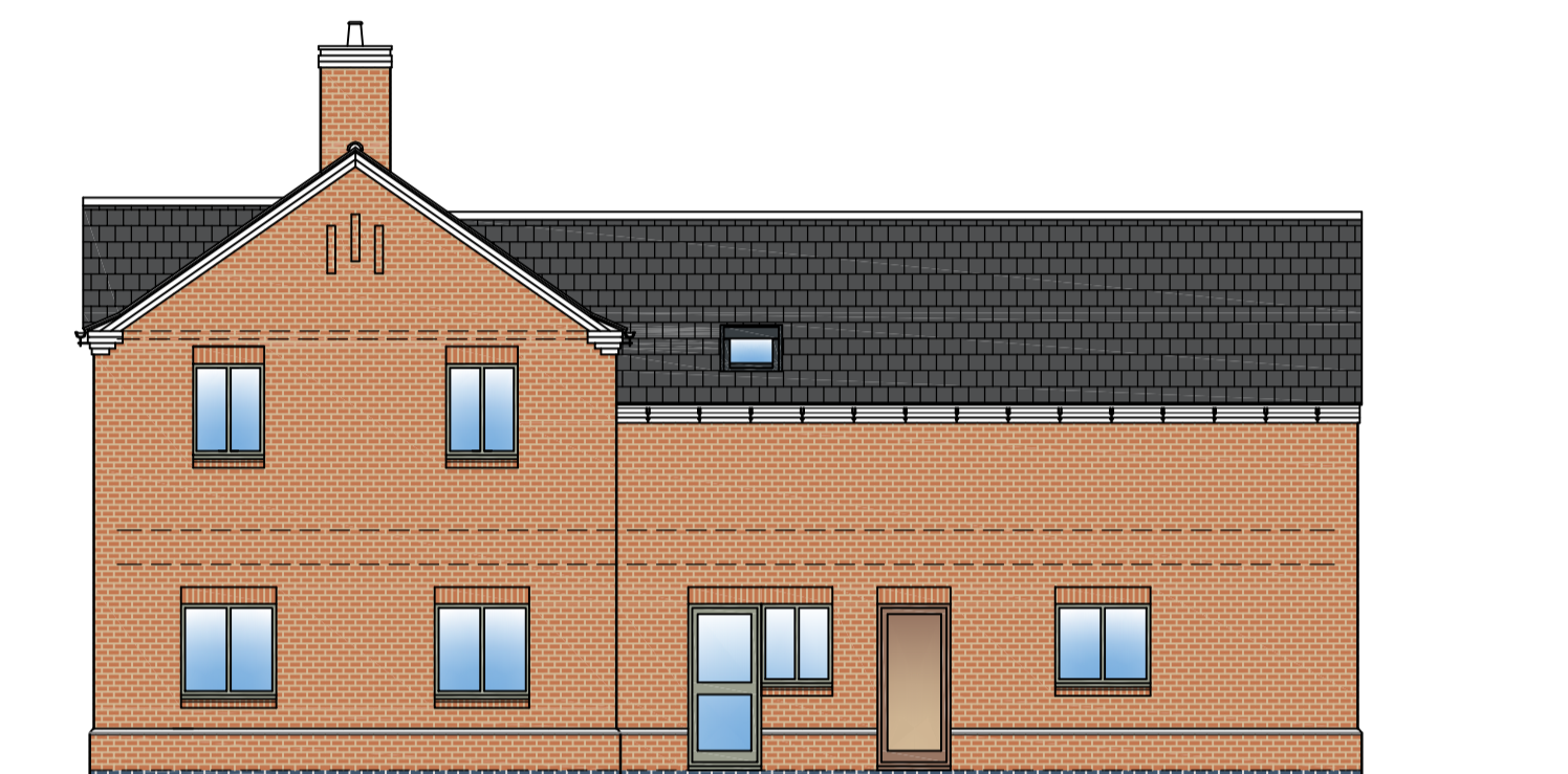
PROPOSED REAR ELEVATION 1/100