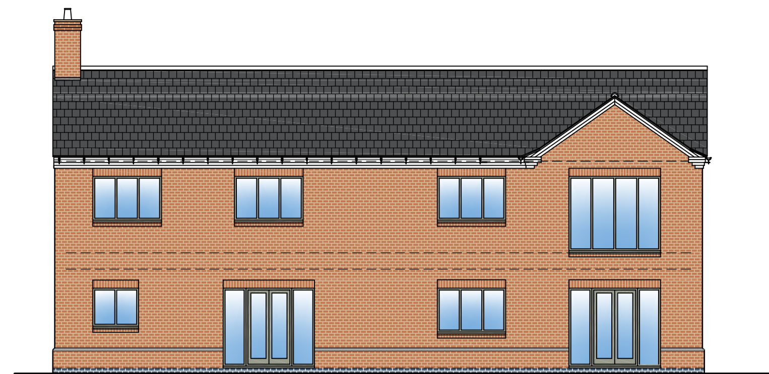
PROPOSED SIDE ELEVATION 1/100