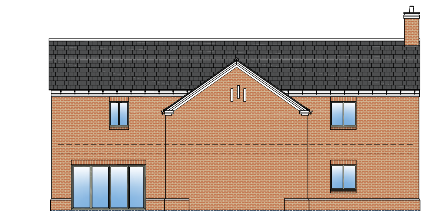
PROPOSED SIDE ELEVATION 1/100