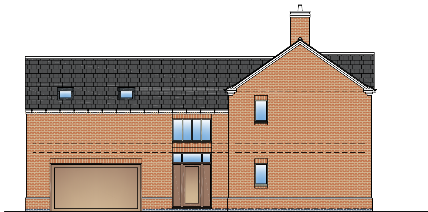
PROPOSED FRONT ELEVATION 1/100