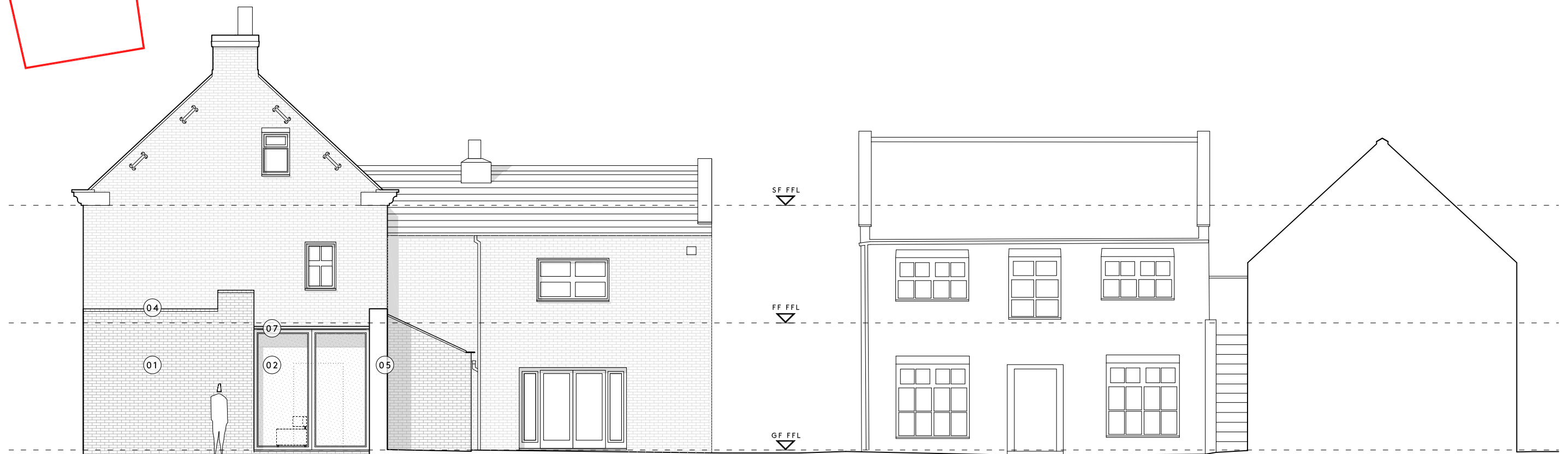
FARM HOUSE (B1)