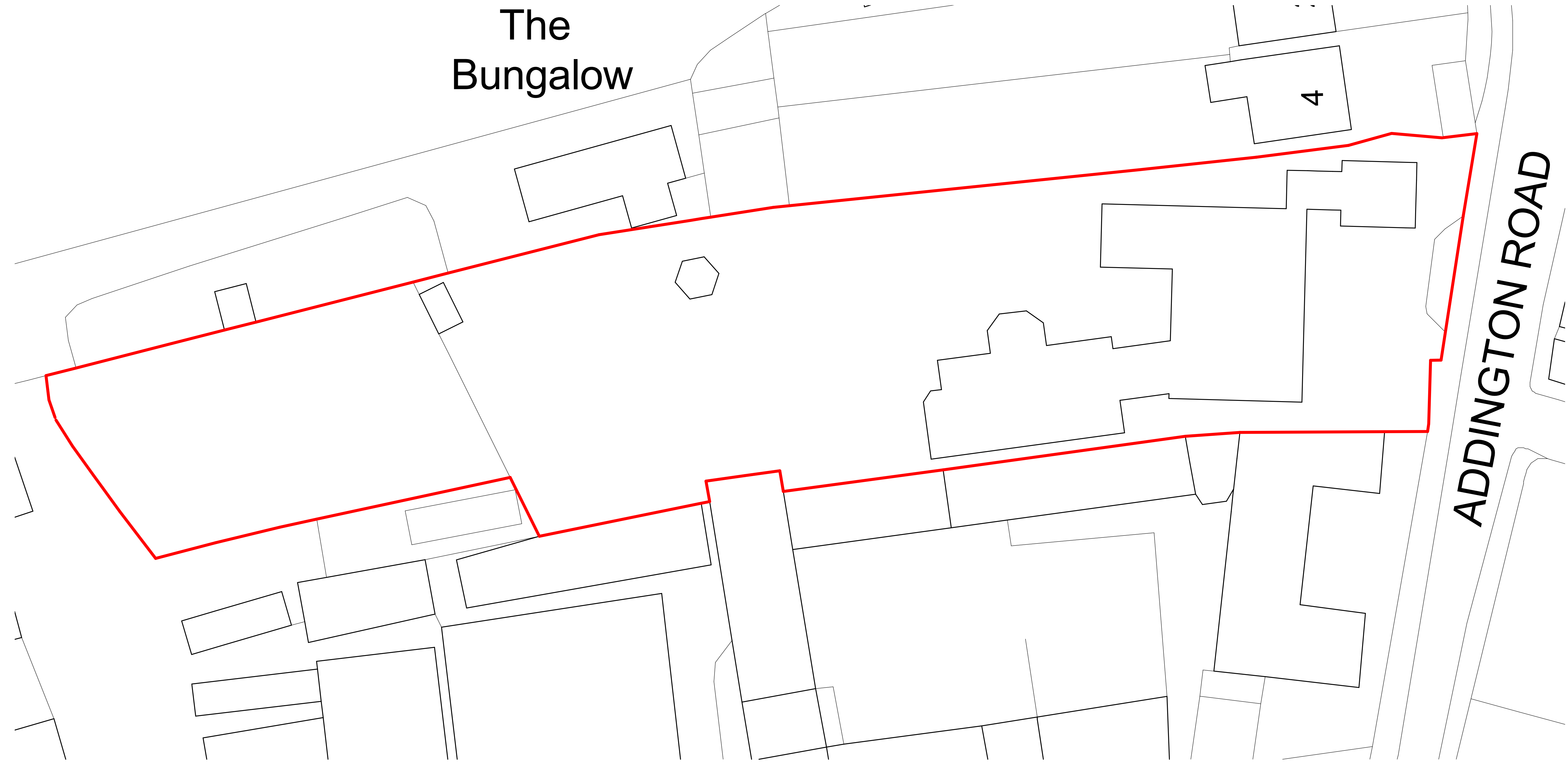
Existing Site Layout 1: 200