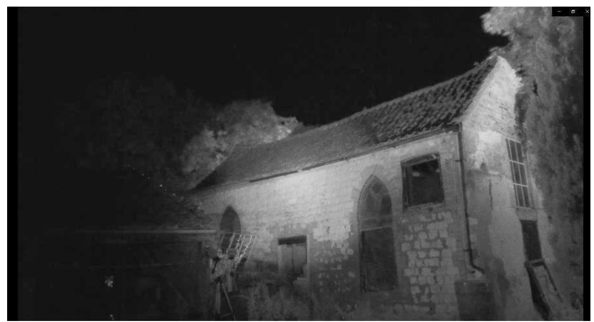
Photo 1 , infrared camera situated on the northwest corner, taken from the darkest part of the survey.