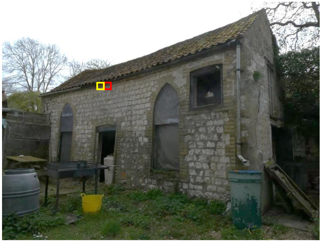
Photo 3, common pipistrelle and brown long-eared roost location on the north aspect of building one highlighted in yellow and red respectively. 7<sup>th</sup> September 2022.