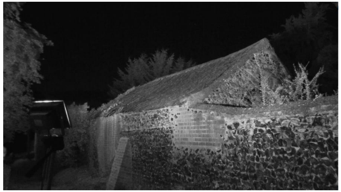
Photo 2 , infrared camera situated on the southeast corner, taken from the darkest part of the survey.