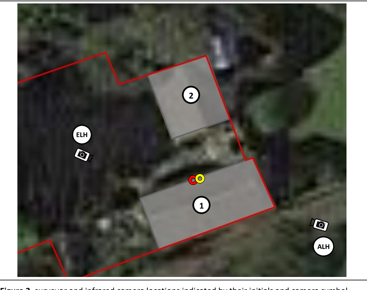
Figure 2, surveyor and infrared camera locations indicated by their initials and camera symbol respectively on 7<sup>th</sup> September 2022.

Common pipistrelle and brown long-eared roosts highlighted in yellow and red respectively.