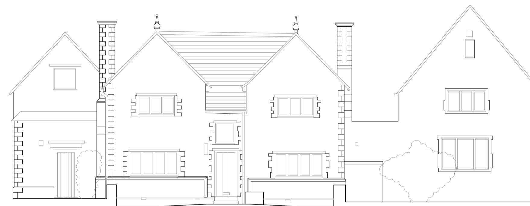
ELEVATION 5 (WEST)