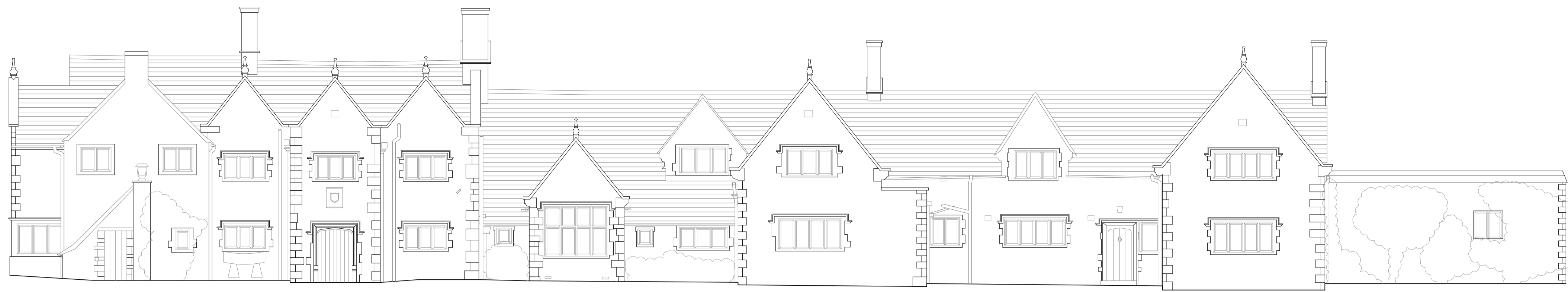
ELEVATION 1 (EAST)