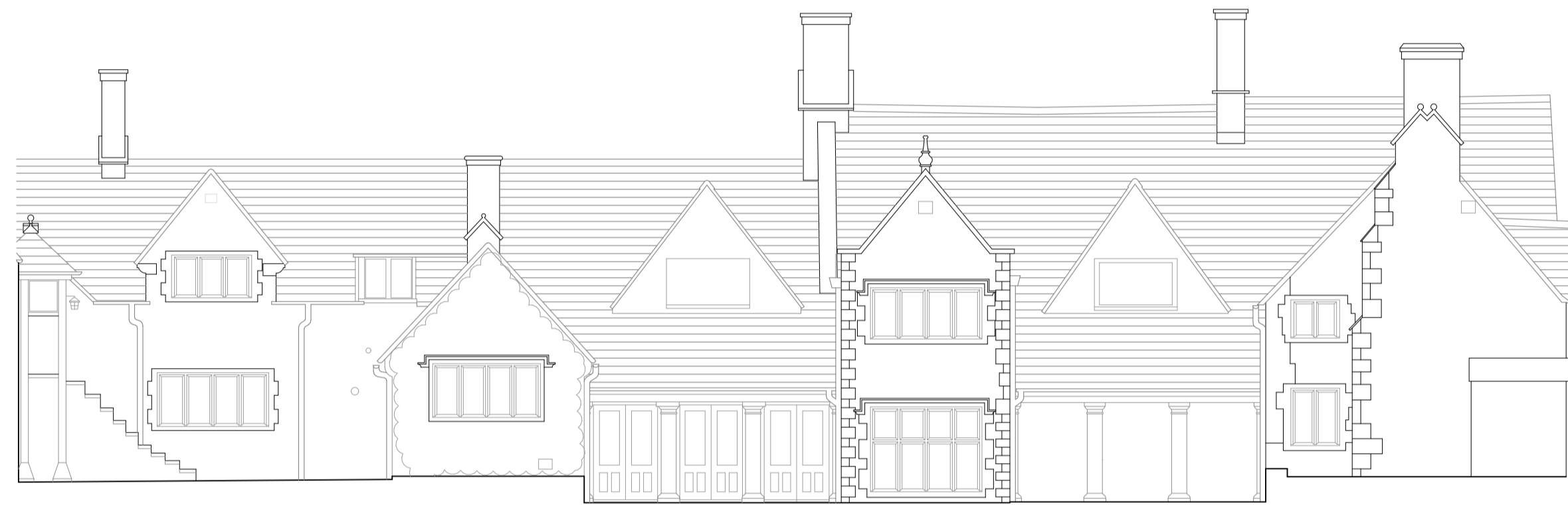
ELEVATION 2 (WEST)