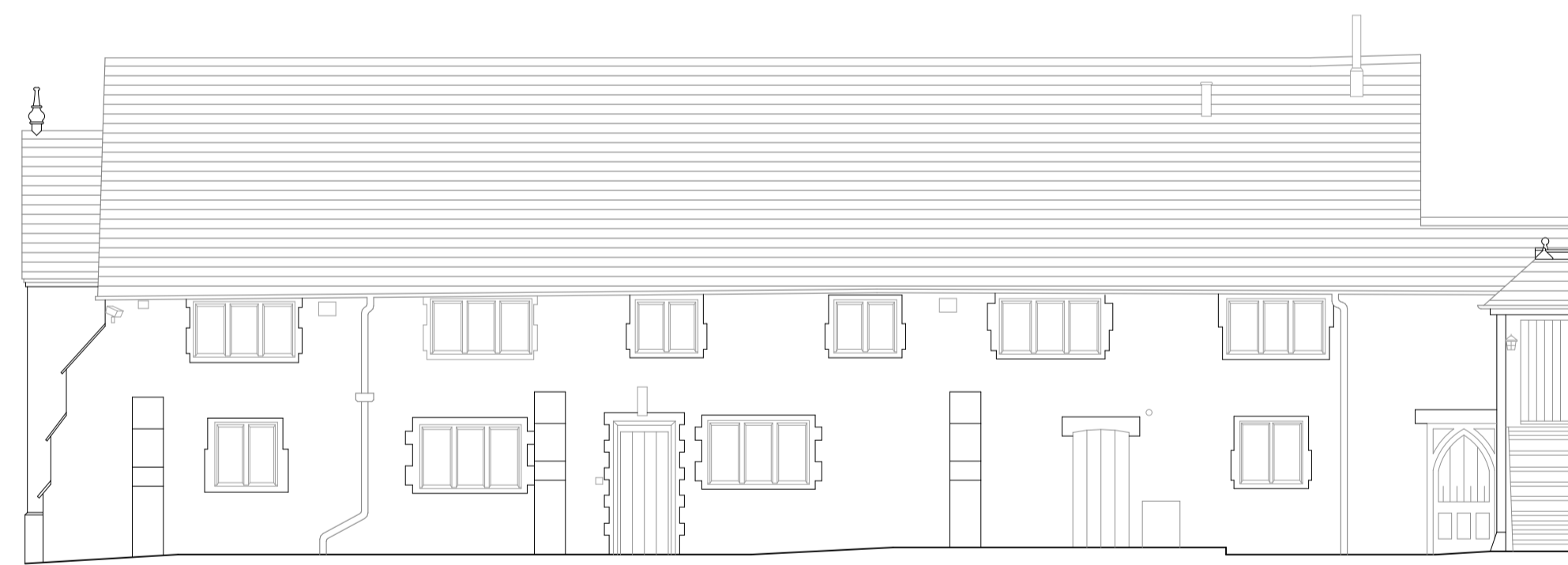
ELEVATION 4 (SOUTH)