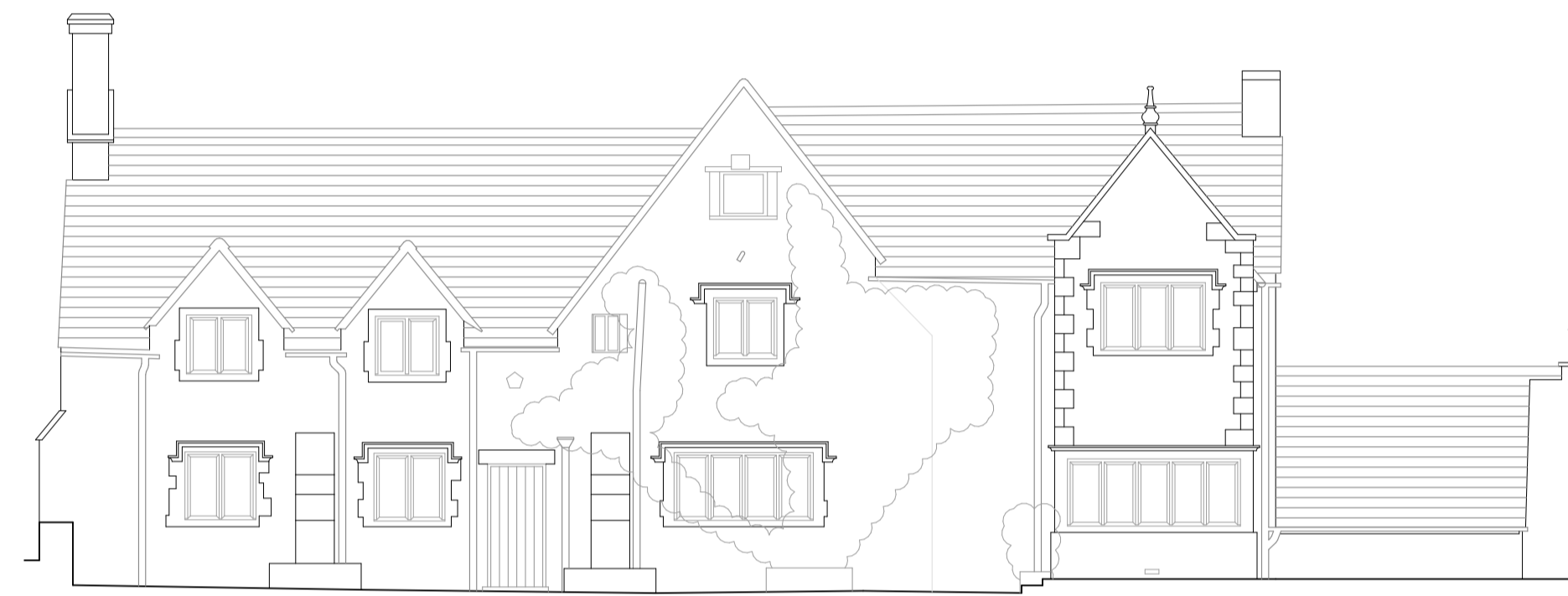
ELEVATION 3 (SOUTH)