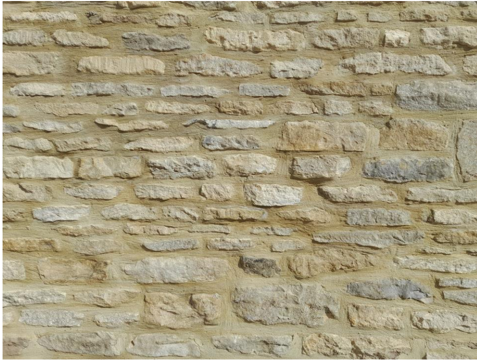
Sample Panel of stone walling and pointing