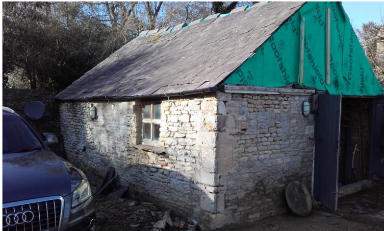
Existing South East Elevation