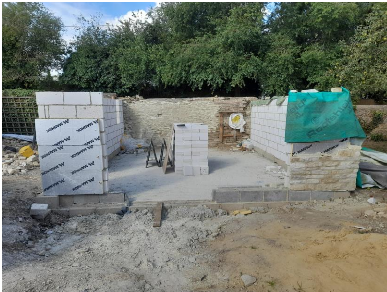
Current View of East Elevation