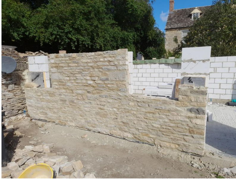
Current view of south elevation