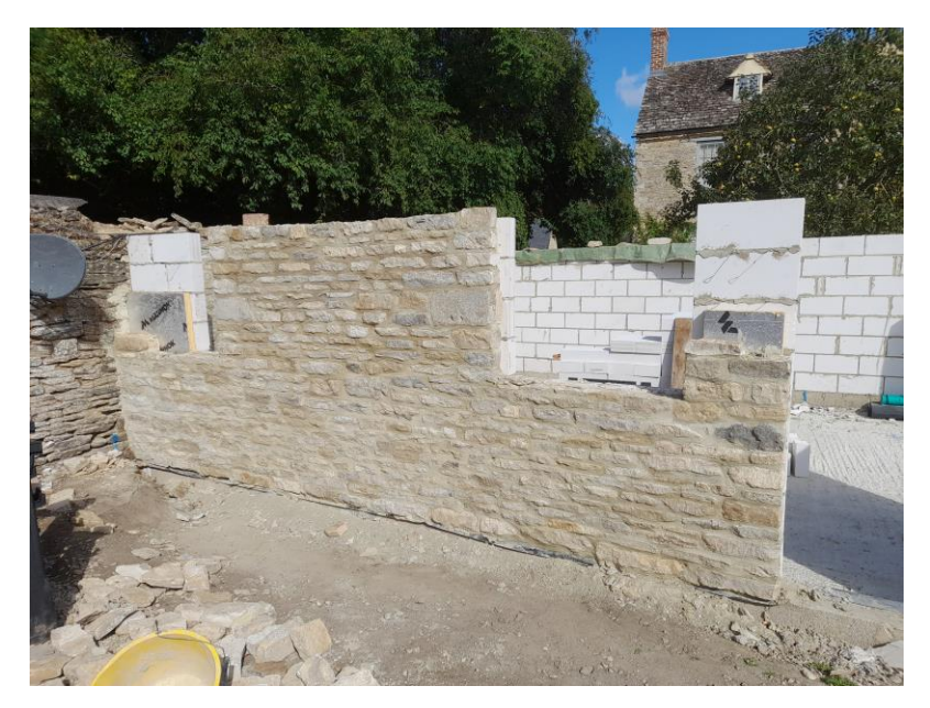
Current view of south elevation