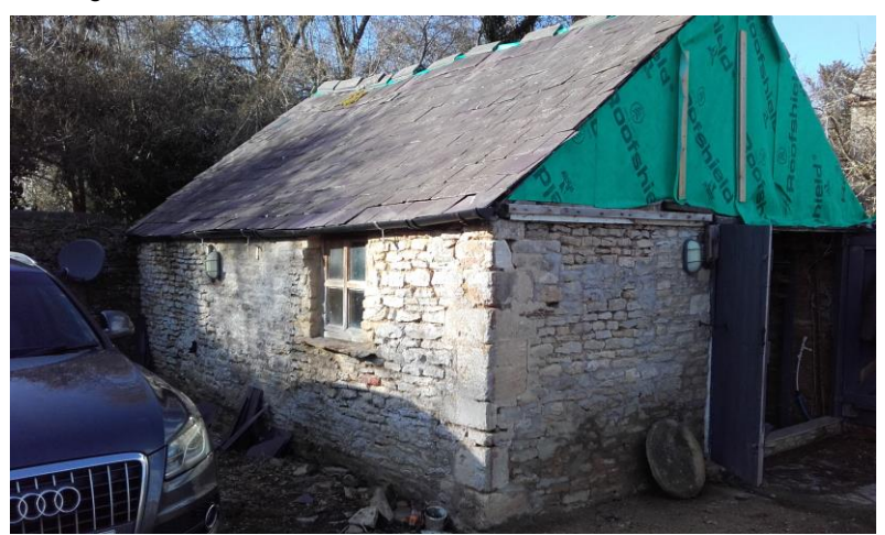
Existing South East Elevation