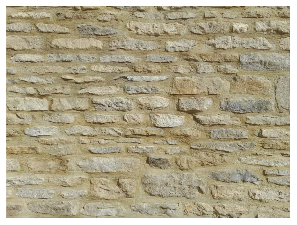
Sample Panel of stone walling and pointing