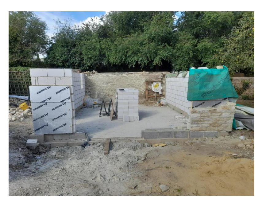
Current View of East Elevation