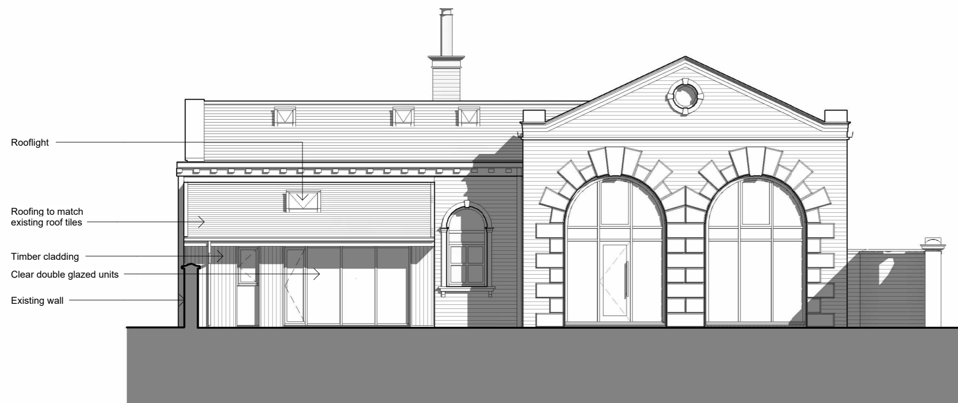
SOUTH FRONT ELEVATION 1:100