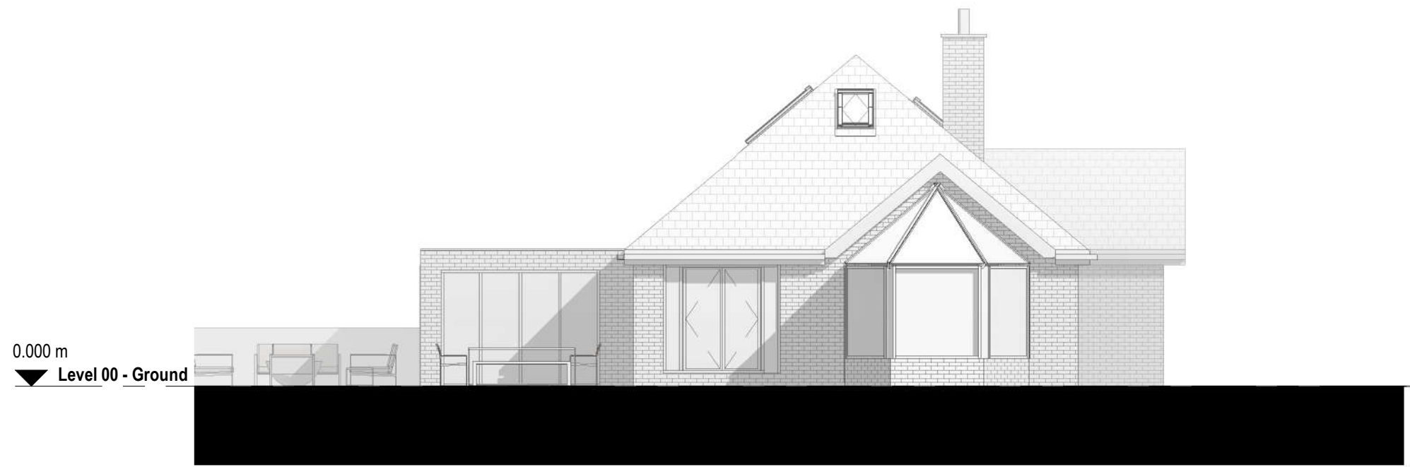
Southwest Elevation 1 : 100