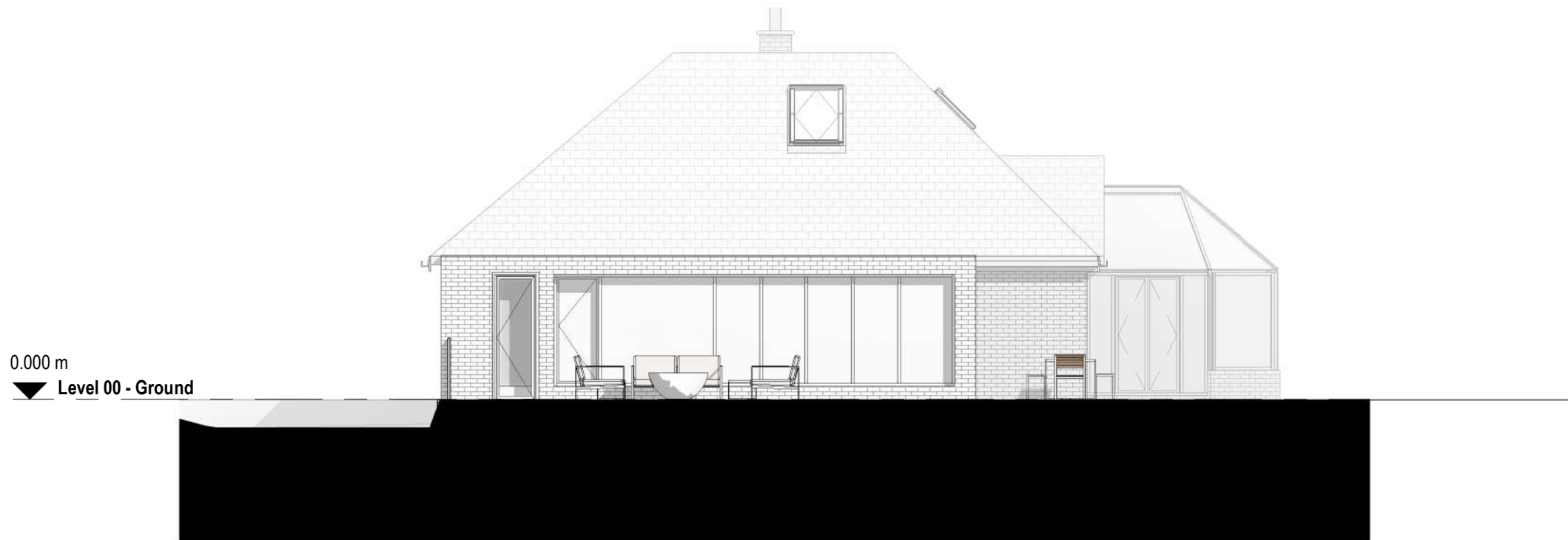
Northwest Elevation 1 : 100