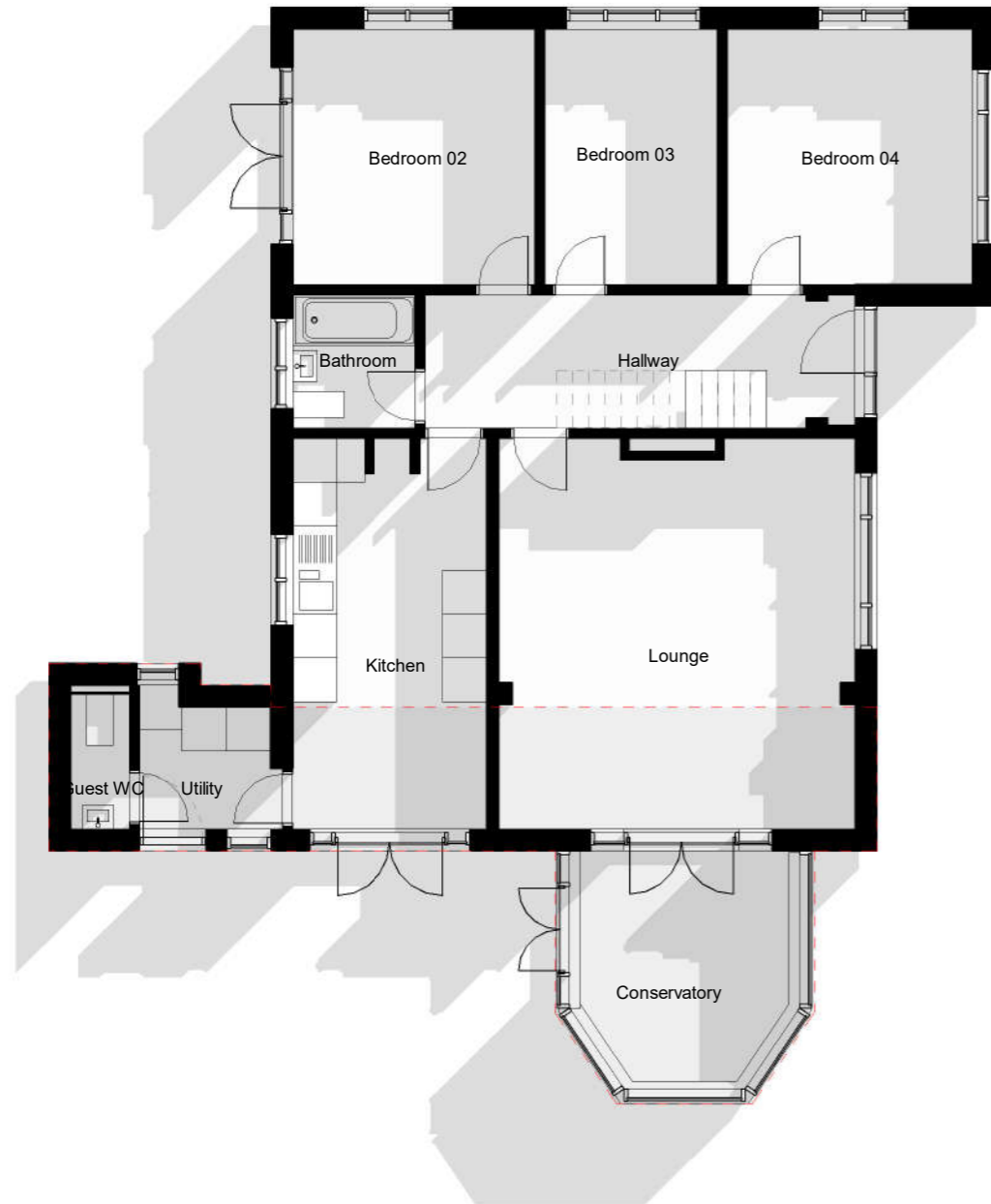
(20) - Level 00 - Existing plan 1 : 100