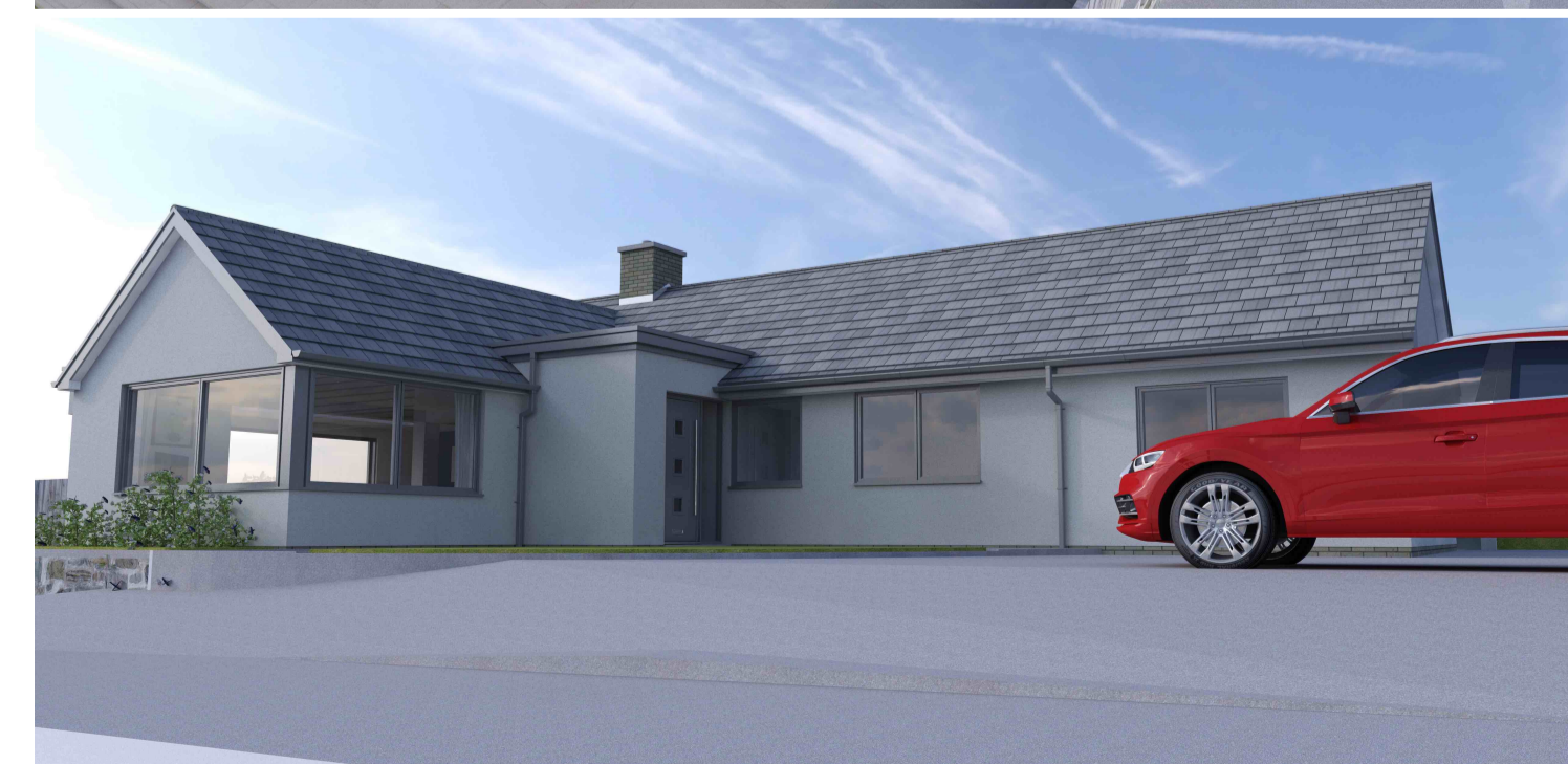
i m a g e s . not to scale

ROOF:- FLAT ROOF FINISHES:- UPVC OR ALUMINIUM OR SIMILAR COLOUR TO BE CONFIRMED FASCIA / SOFFIT:- UPVC OR ALUMINIUM OR SIMILAR COLOUR TO BE CONFIRMED WALLS:- RENDER WITH BRICK PLATH TO MATCH EXISTING WINDOWS:- UPVC OR ALUMINIUM OR SIMILAR COLOUR TO BE CONFIRMED DOORS:- UPVC OR ALUMINIUM OR SIMILAR COLOUR TO BE CONFIRMED FEATURE FRONT DOOR TO CLIENTS EXACT REQUIREMENTS p r o p o s e d m a t e r i a l s .