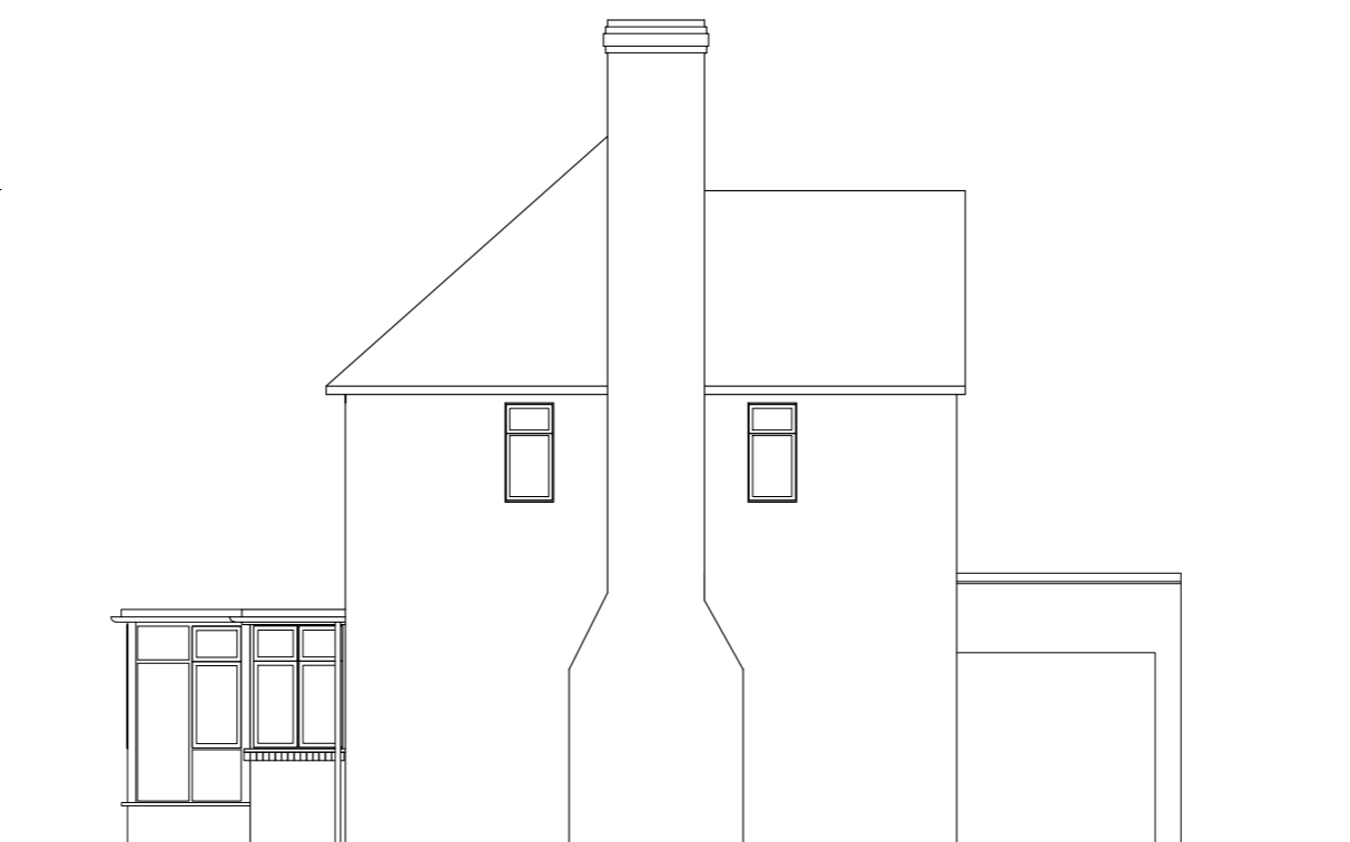
EXISTING SOUTH FACING SIDE ELEVATION