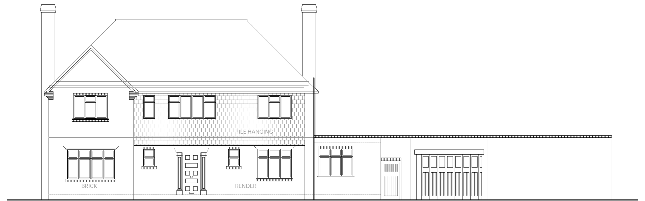
EXISTING EAST FACING FRONT ELEVATION