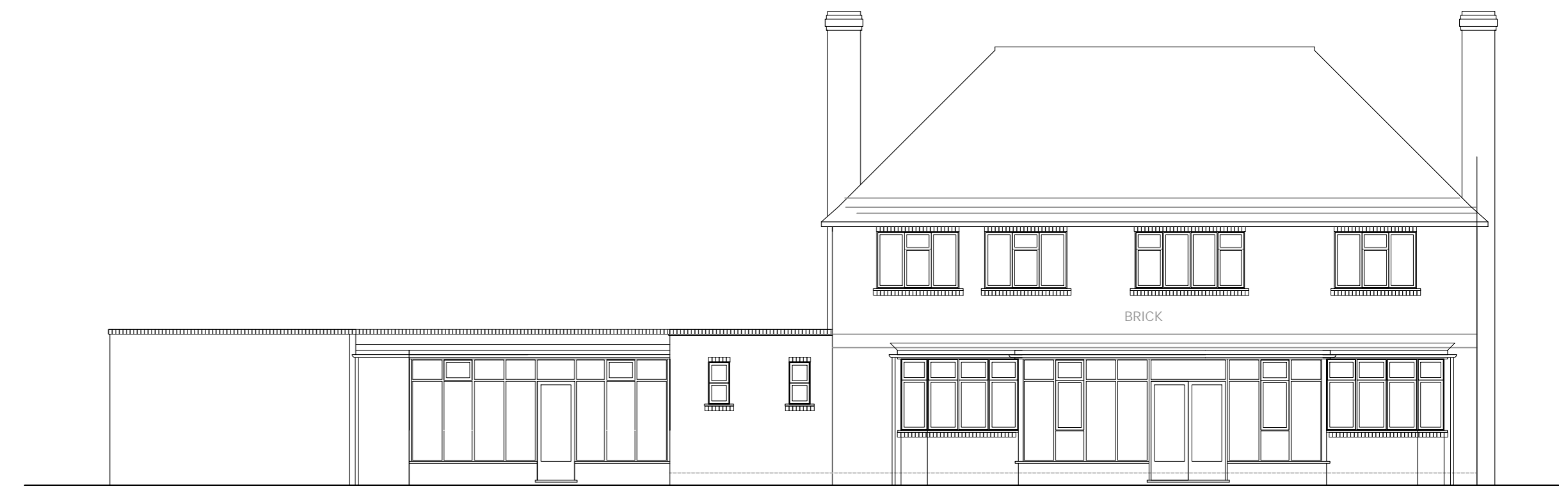
EXISTING WEST FACING REAR ELEVATION