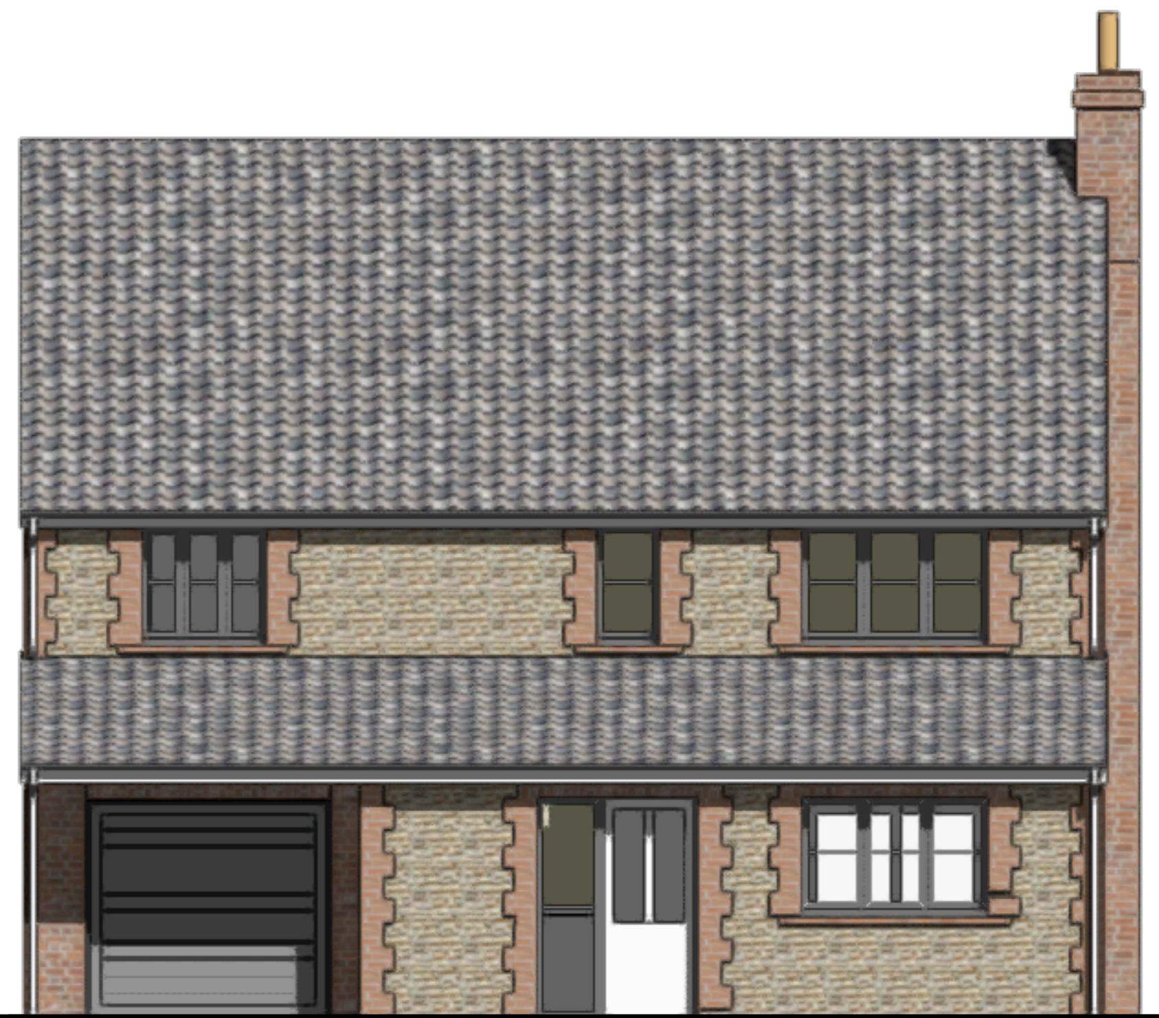
NORTH ELEVATION 1:50