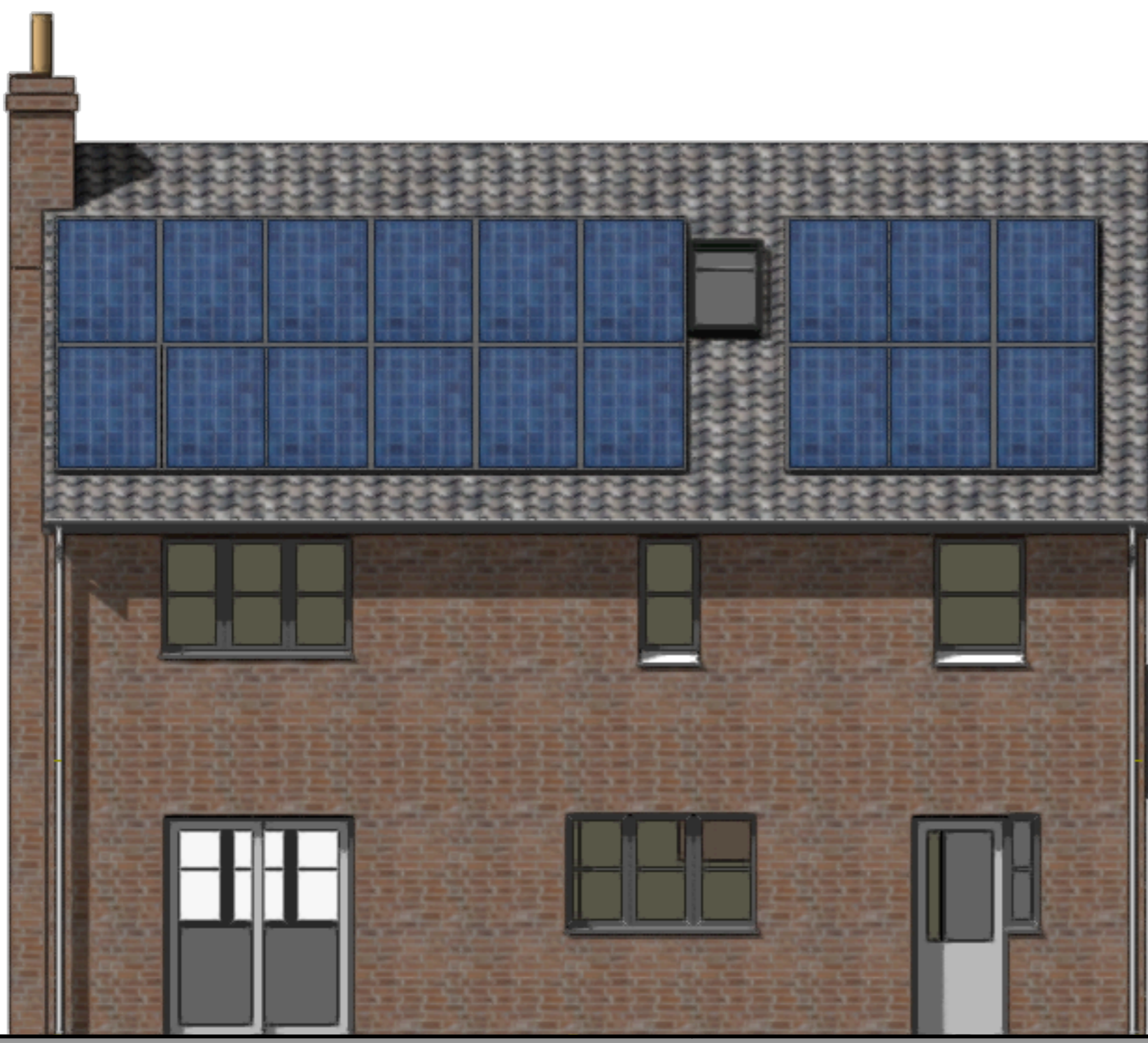
SOUTH ELEVATION 1:50