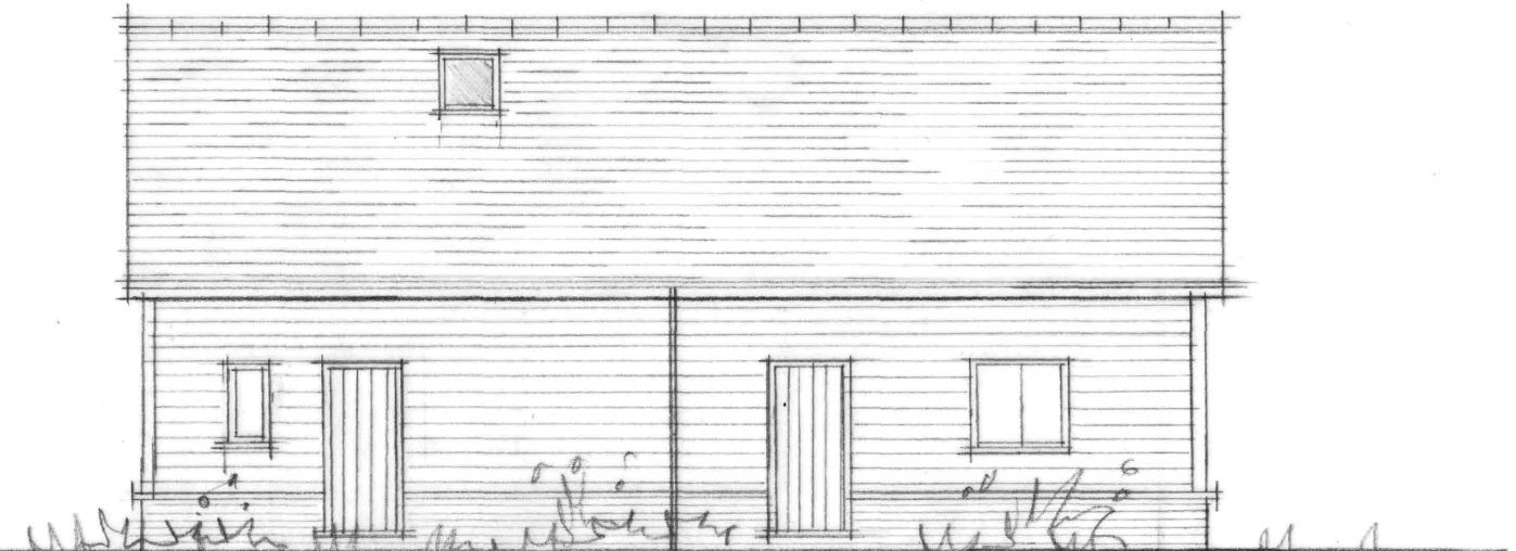
Front Elevation ( north - facing Coopers Lane )