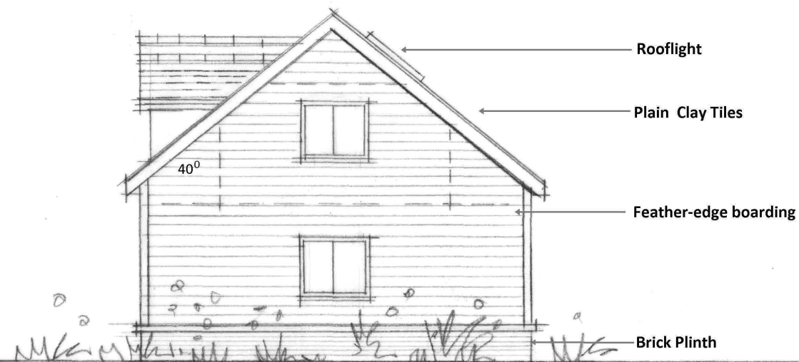
Side Elevation ( east - towards Ashold Farm )