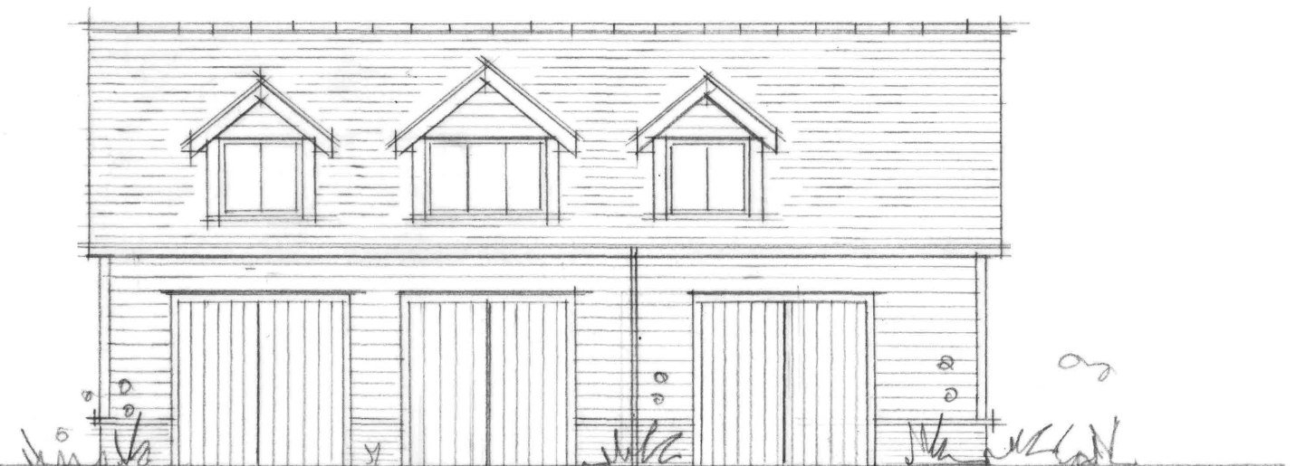
Rear Elevation ( south - facing garden )