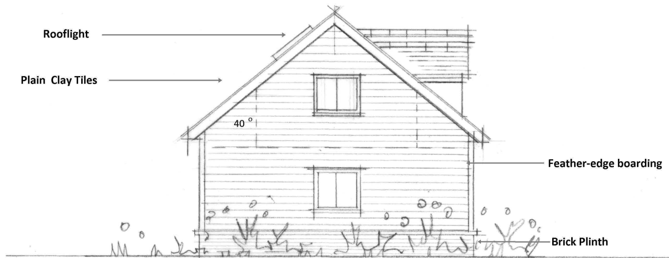
Side Elevation ( east - facing open fields )