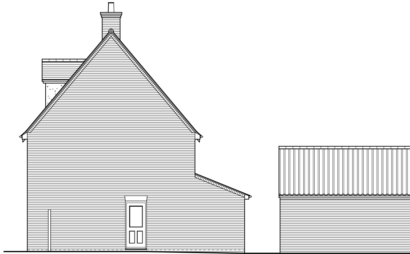
Existing Side Elevation - 1:100