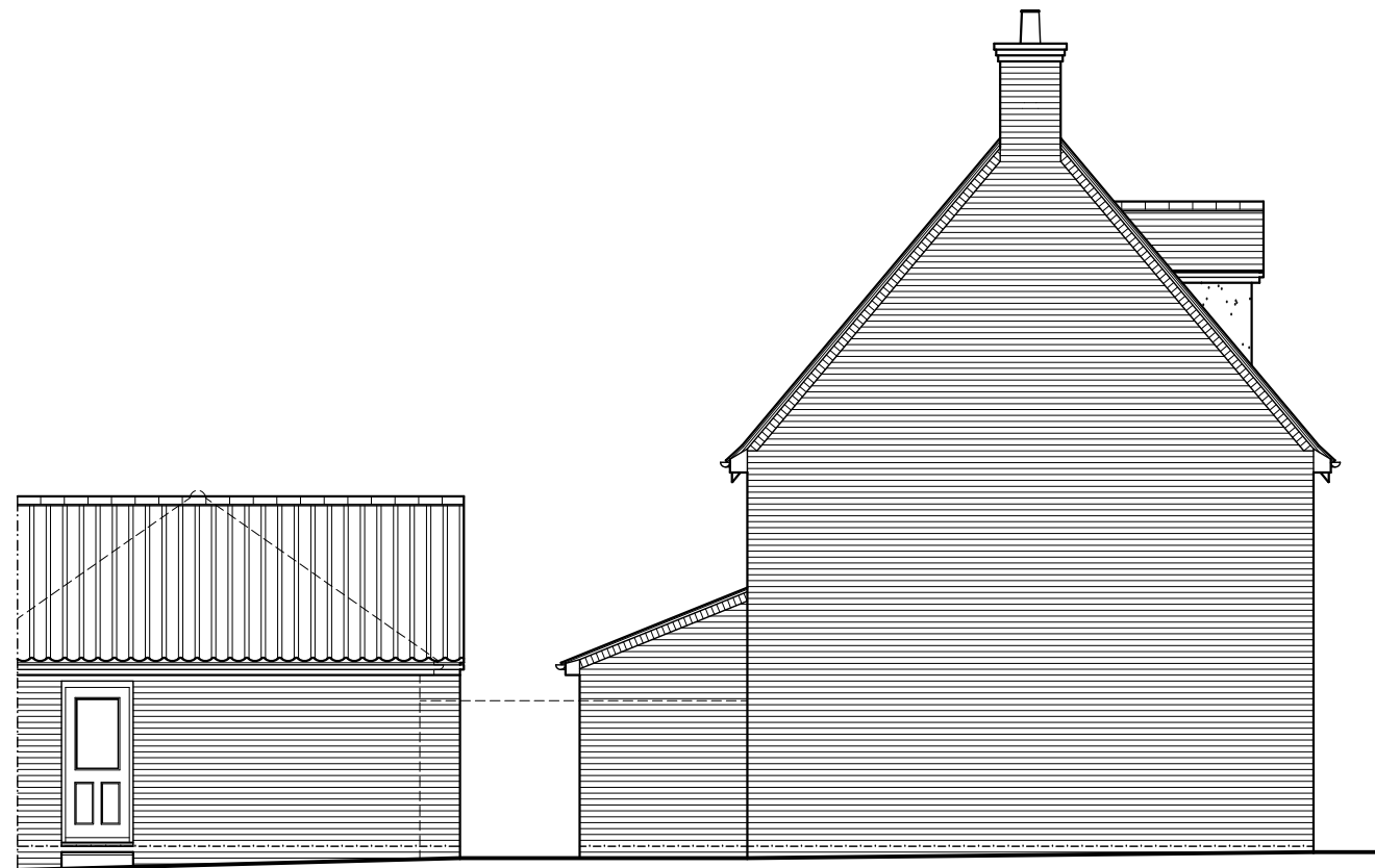
Existing Side Elevation - 1:100