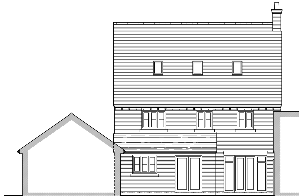
Existing Rear Elevation - 1:100