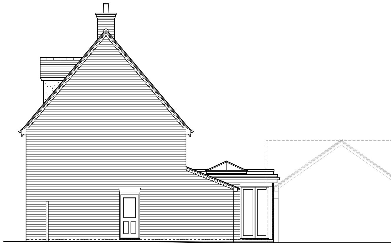
Proposed Side Elevation - 1:100