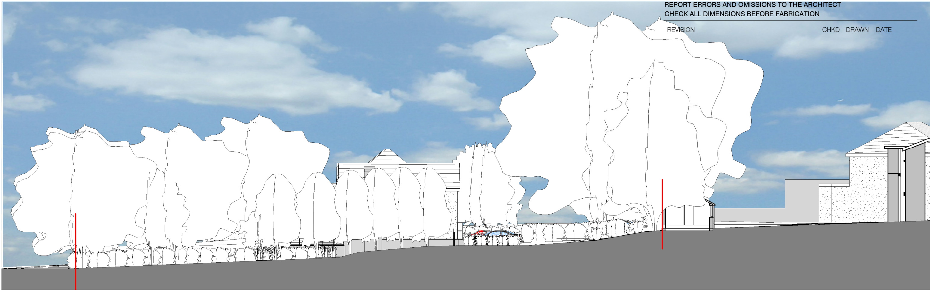
1 Elevation 3 1 : 200