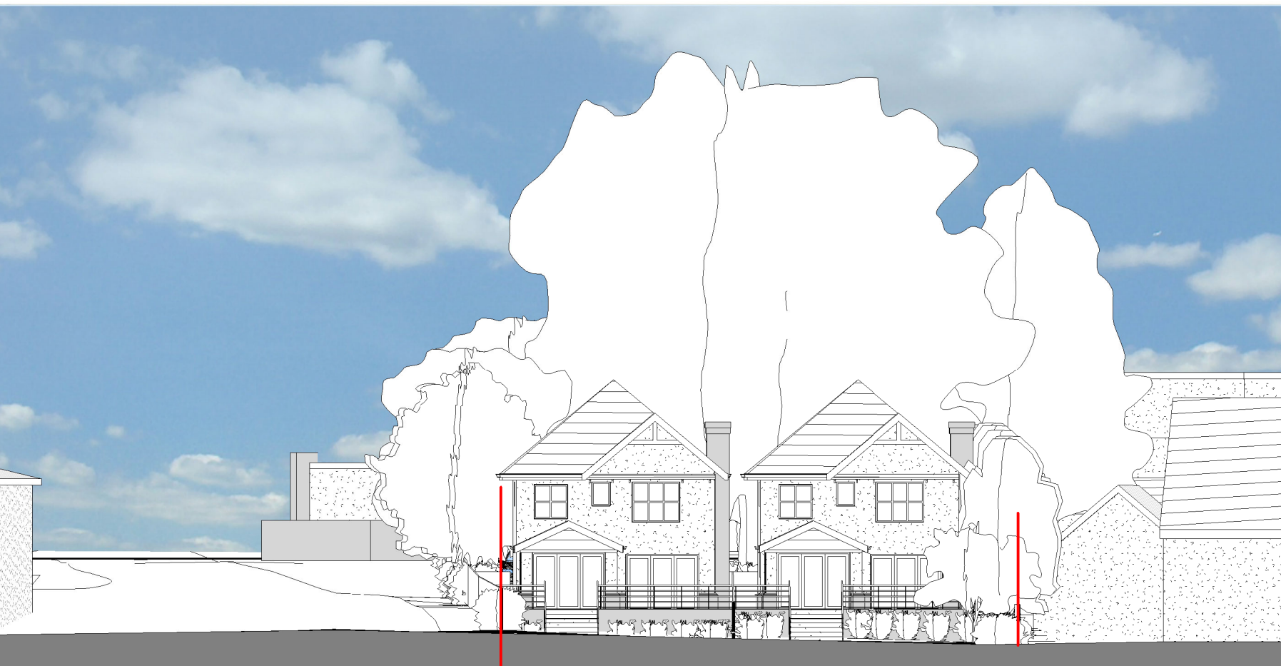
2 Elevation 4 1 : 200