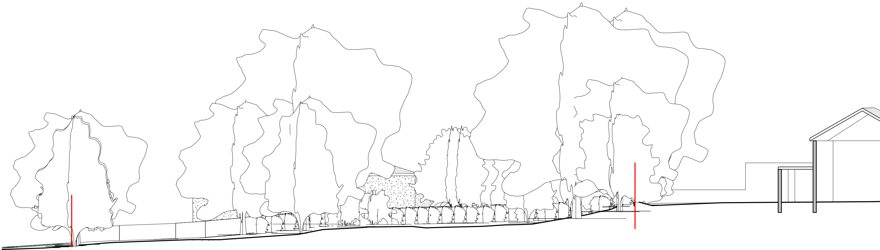
1 Elevation 3 1 : 200