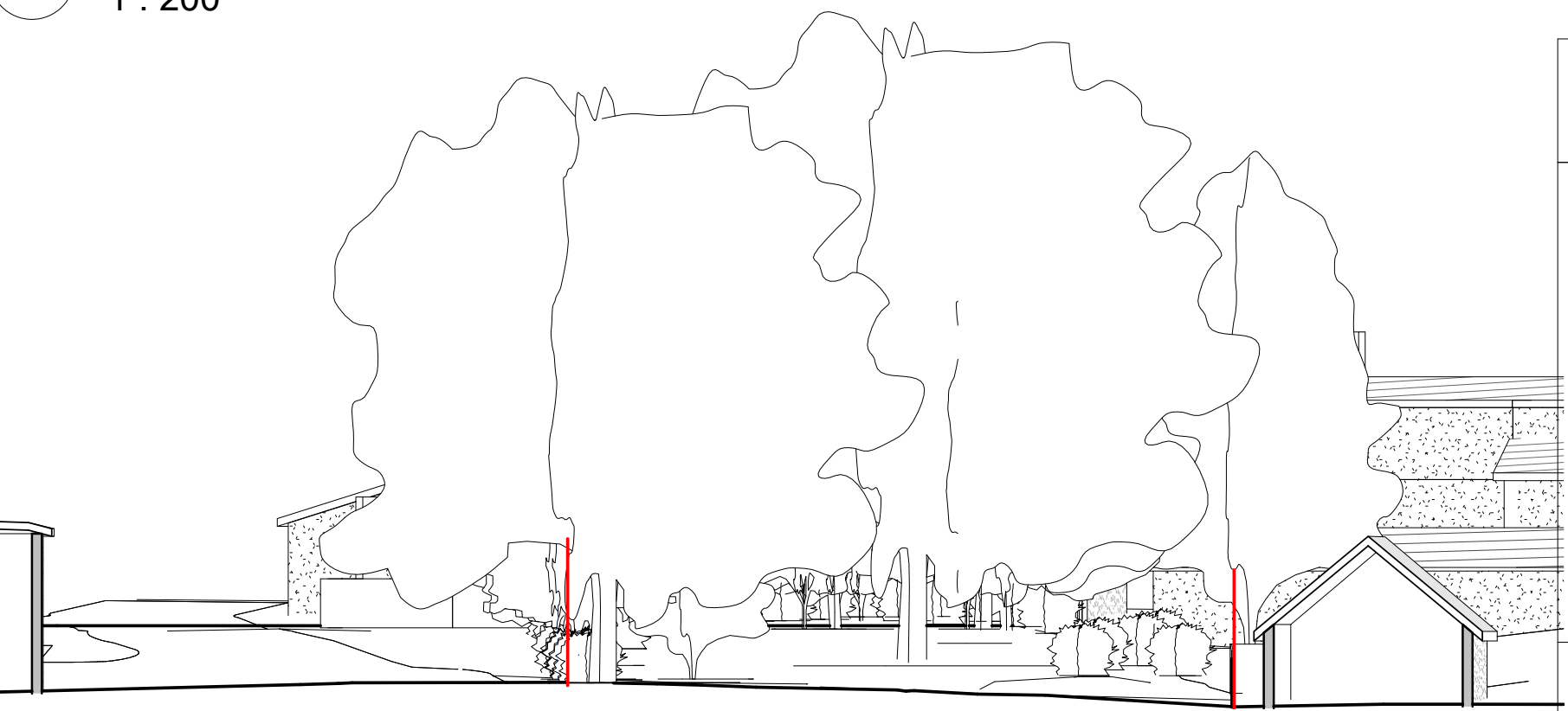
2 Elevation 4 1 : 200