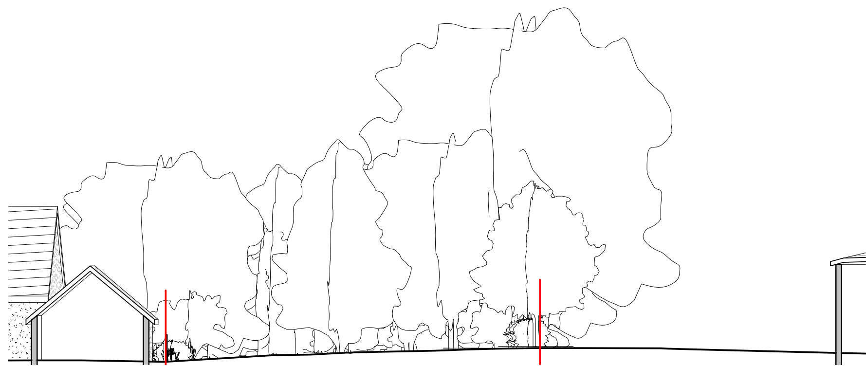
2 Elevation 2 1 : 200