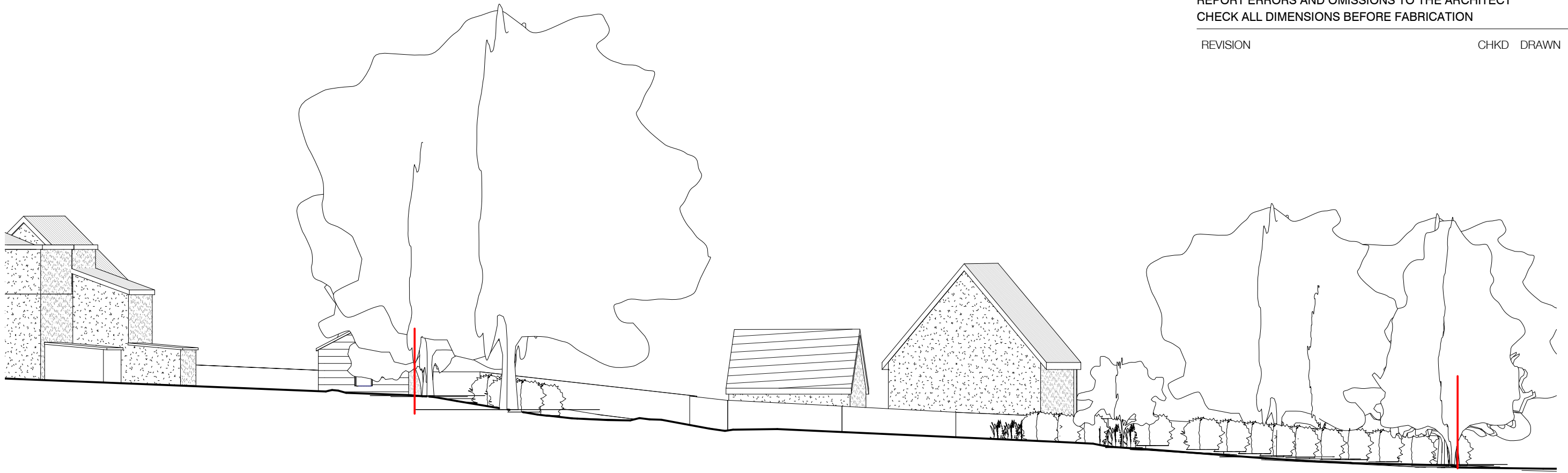
1 Elevation 1 1 : 200