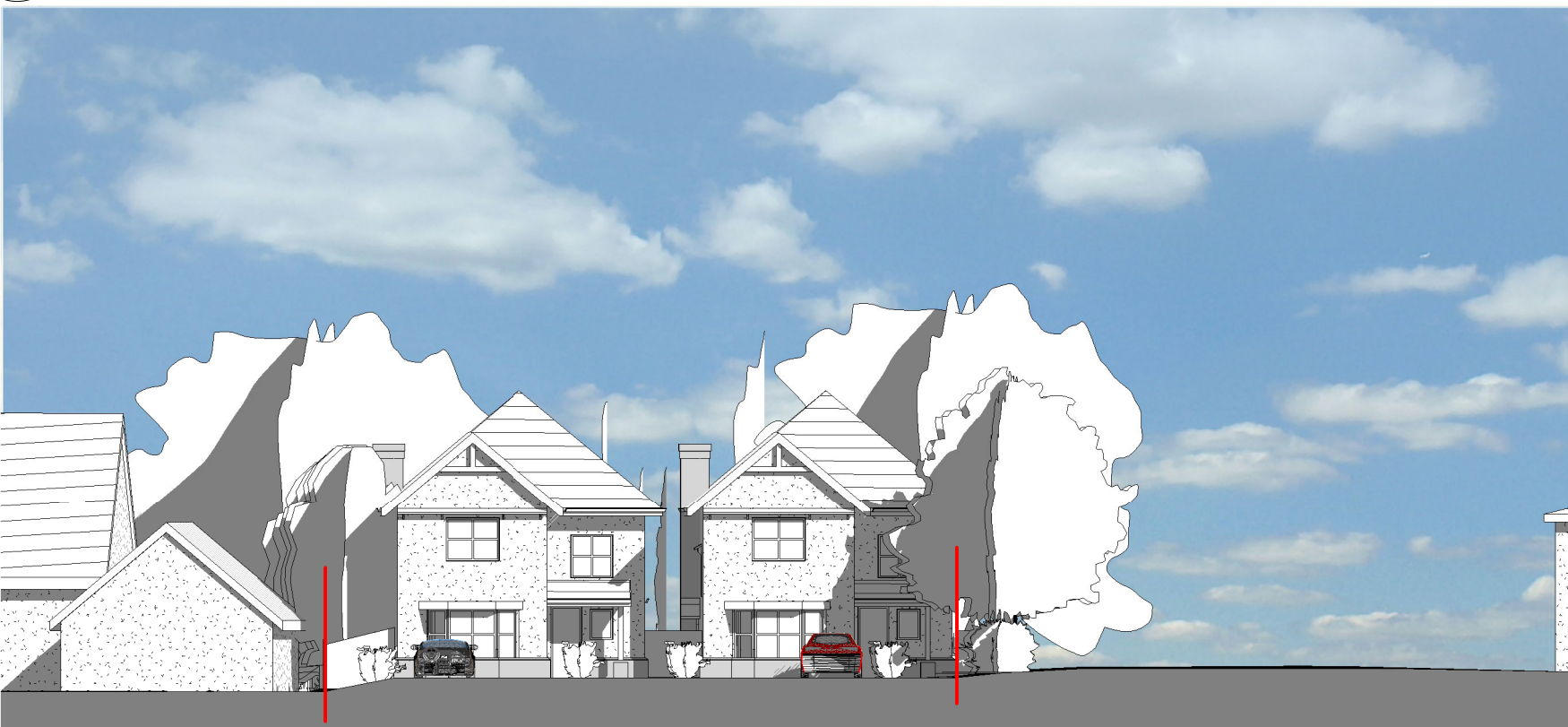
2 Elevation 2 1 : 200