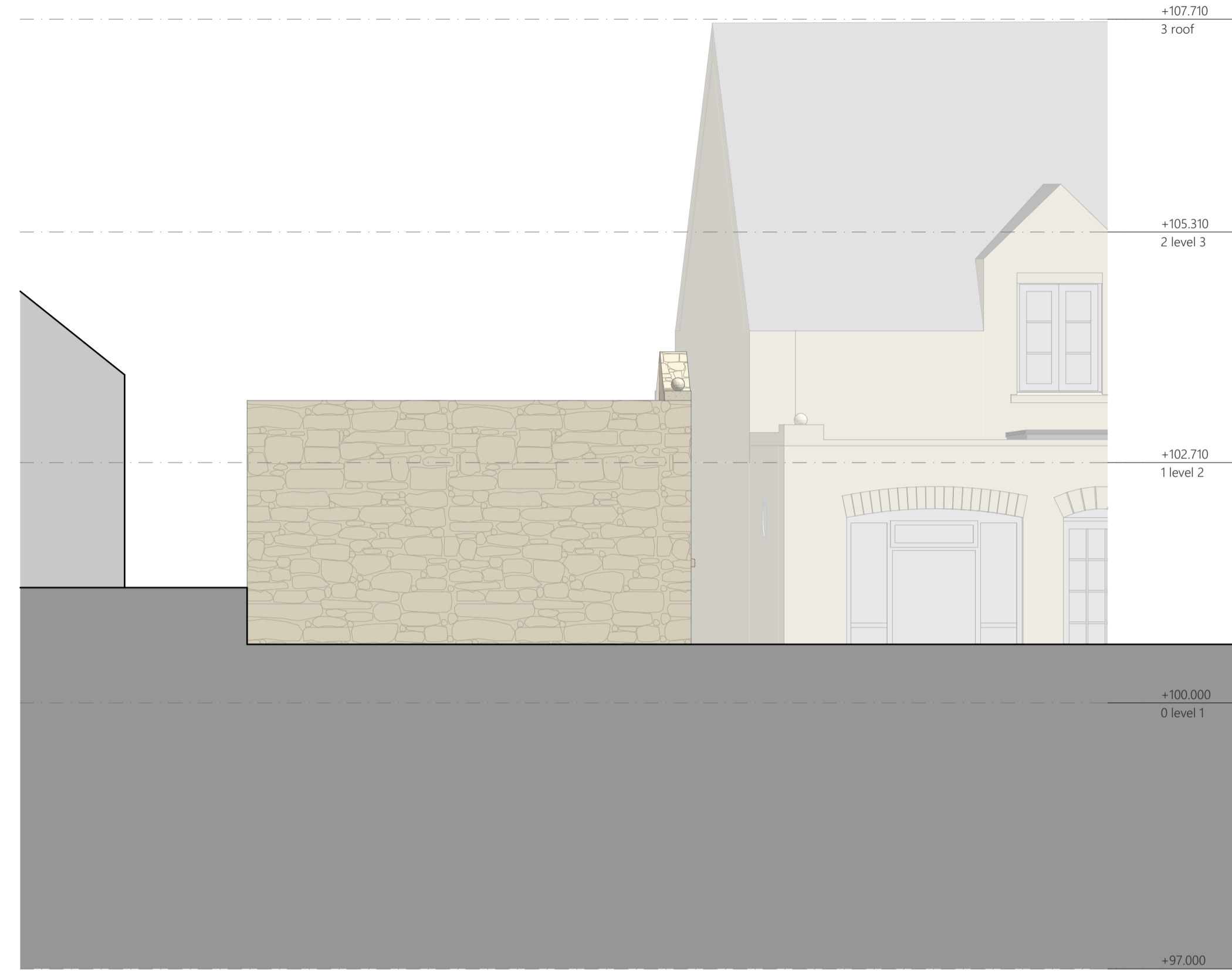
Existing Garage South Elevation 1:50