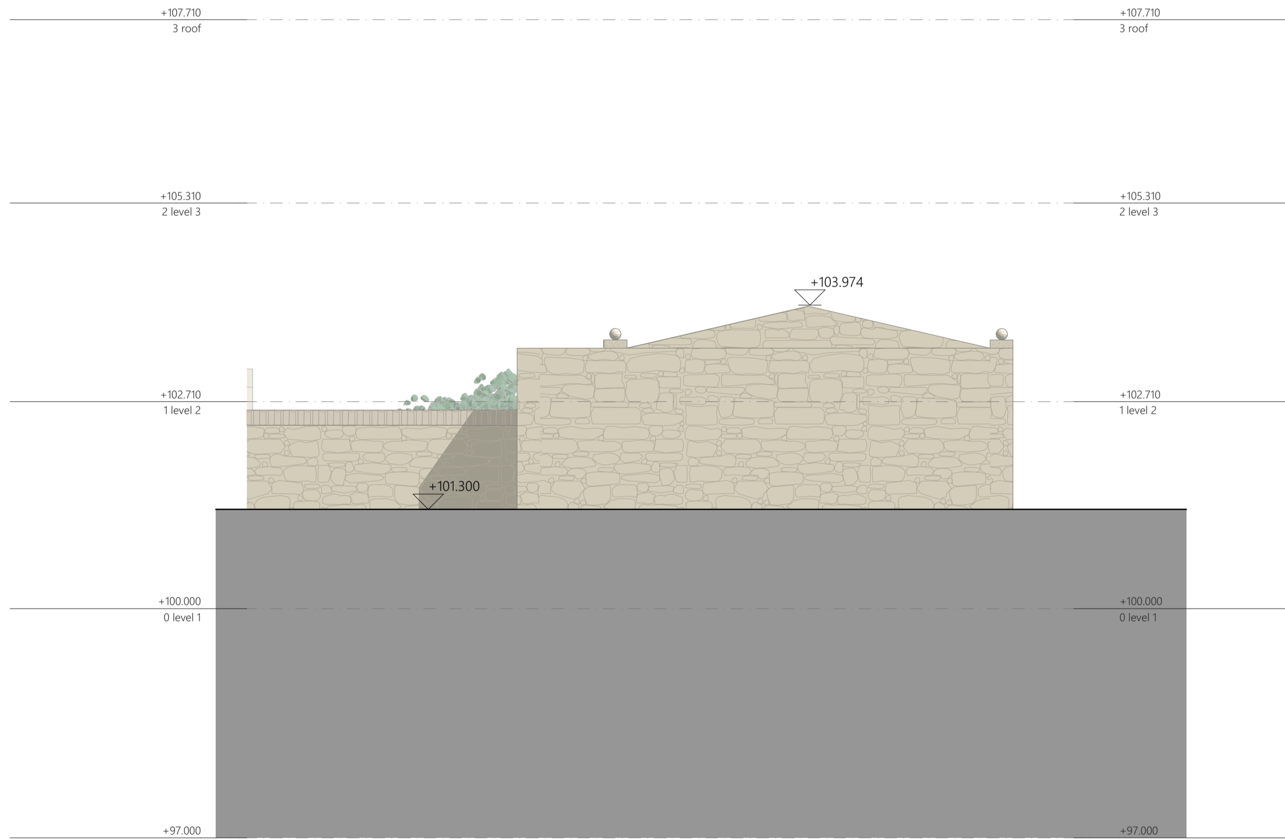
Existing Garage West Elevation 1:50