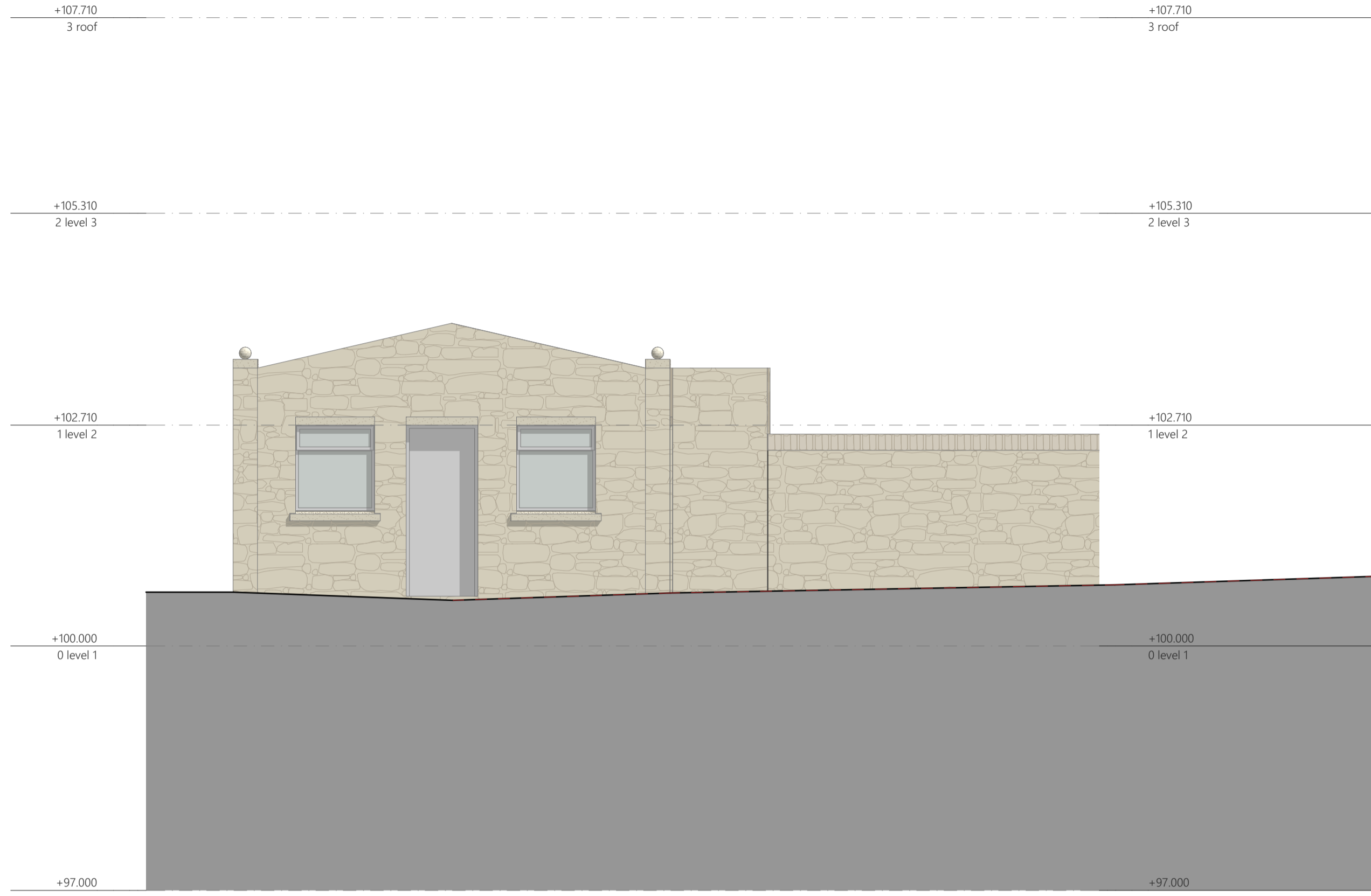
Existing Garage East Elevation 1:50

Note: Datum levels derived from AJ Horner survey information. Levels are arbitrary based on finished floor level of existing South Orchard House, value 100.00m.