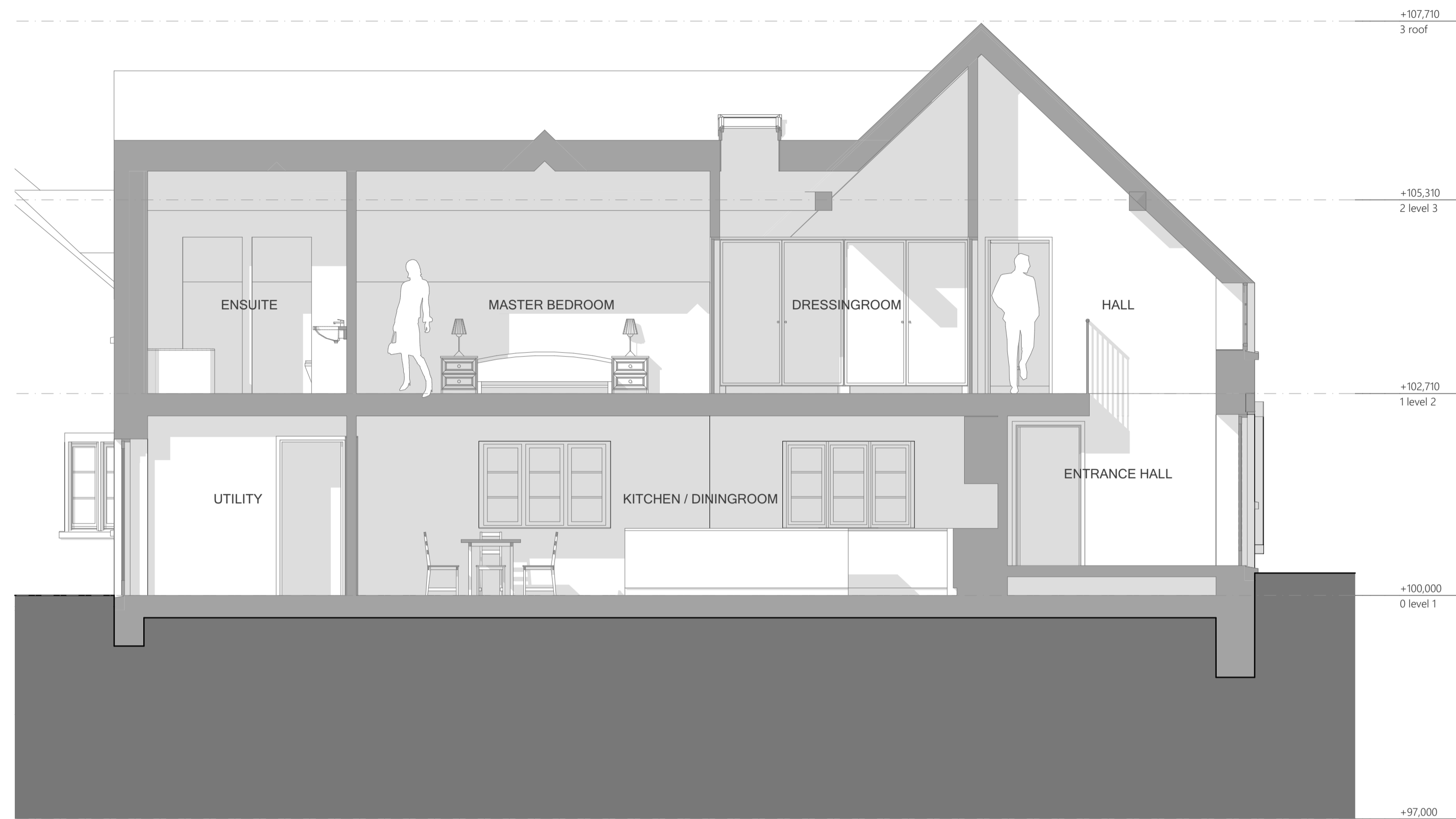
S-01 Proposed Section AA 1:50

Note: Datum levels derived from AJ Horner survey information. Levels are arbitrary based on finished floor level of existing South Orchard House, value 100.00m.