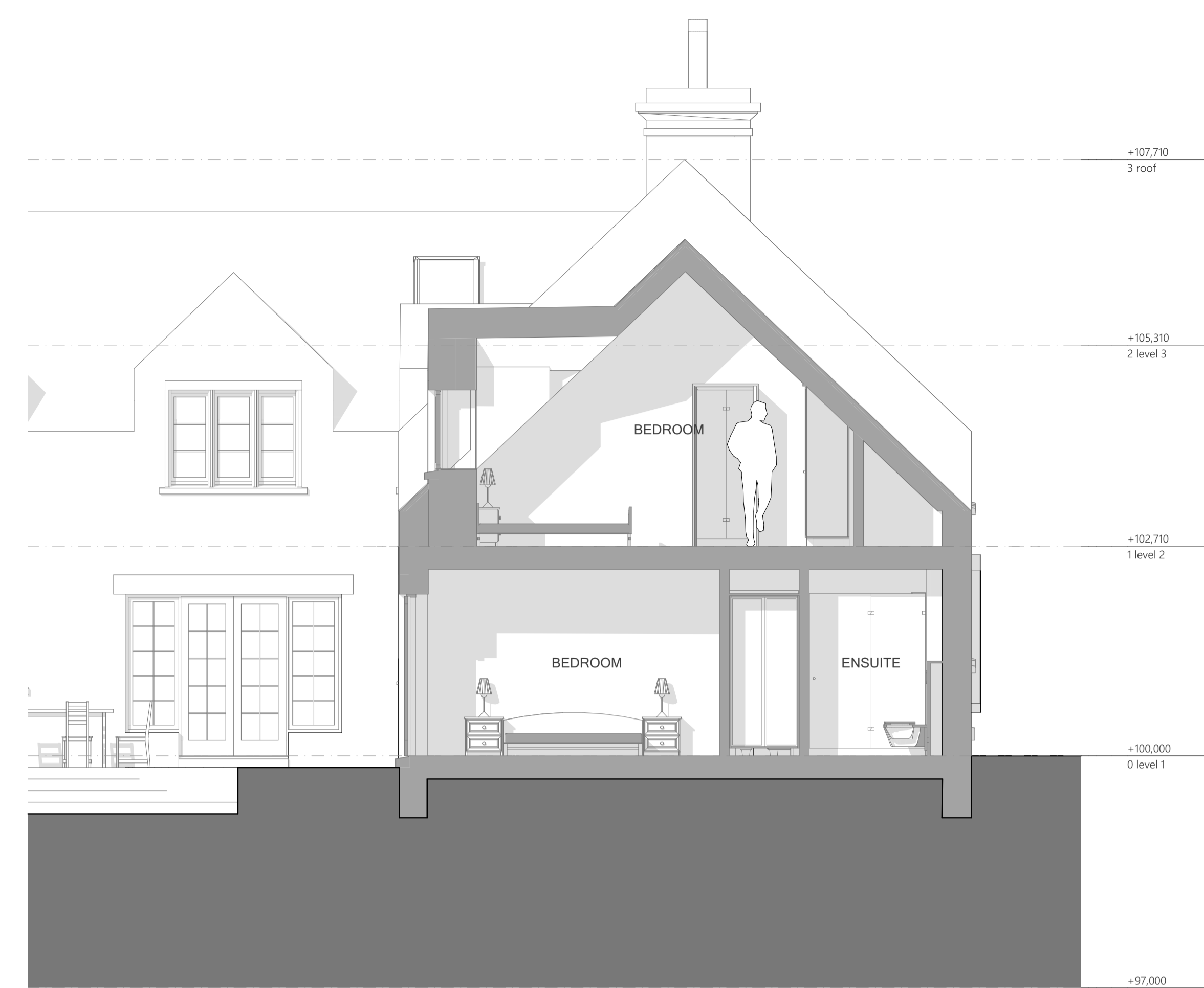
S-02 Proposed Section BB 1:50