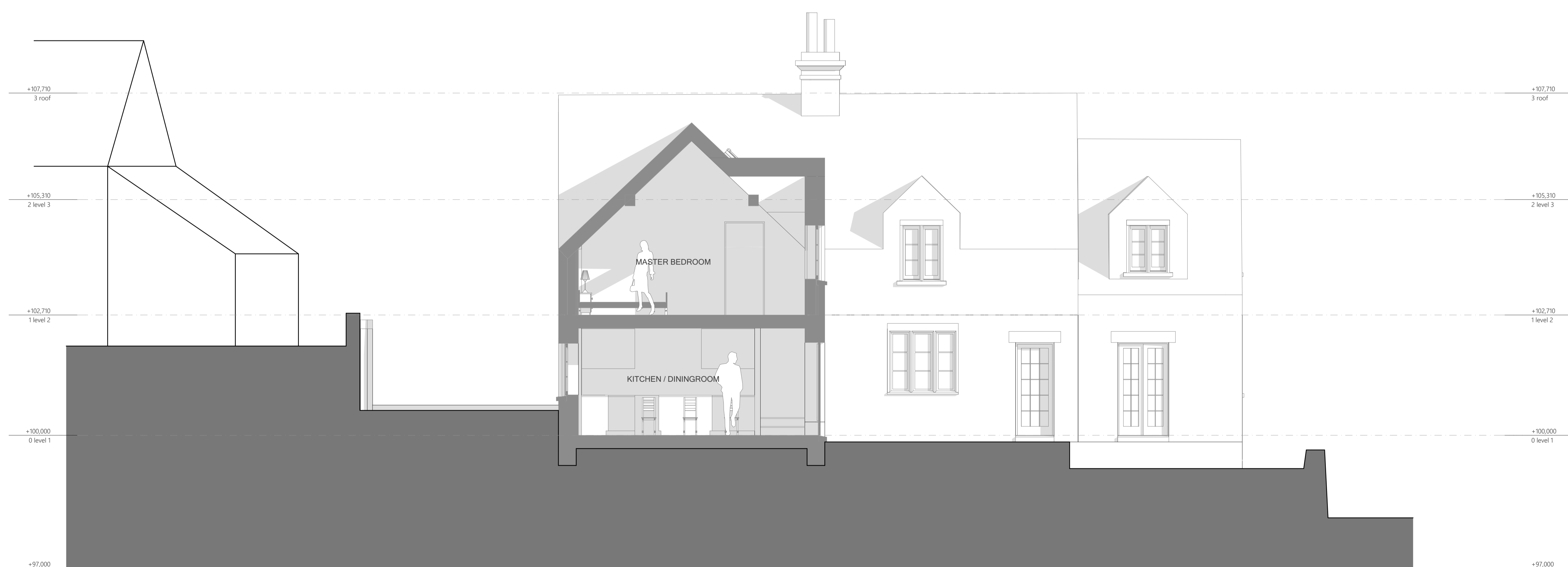
S-03 Proposed Section CC 1:50