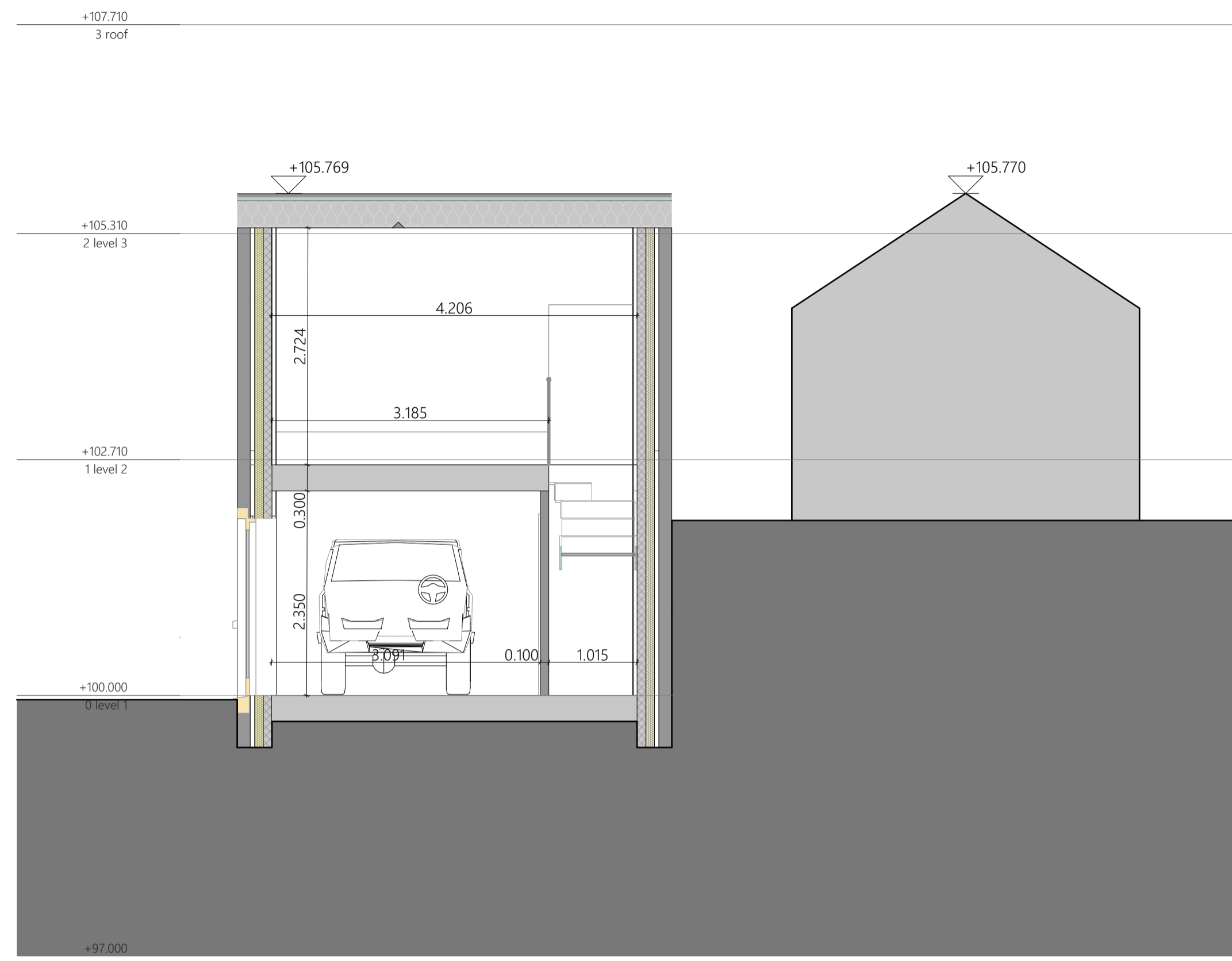
S-07 Proposed Garage Section EE 1:50