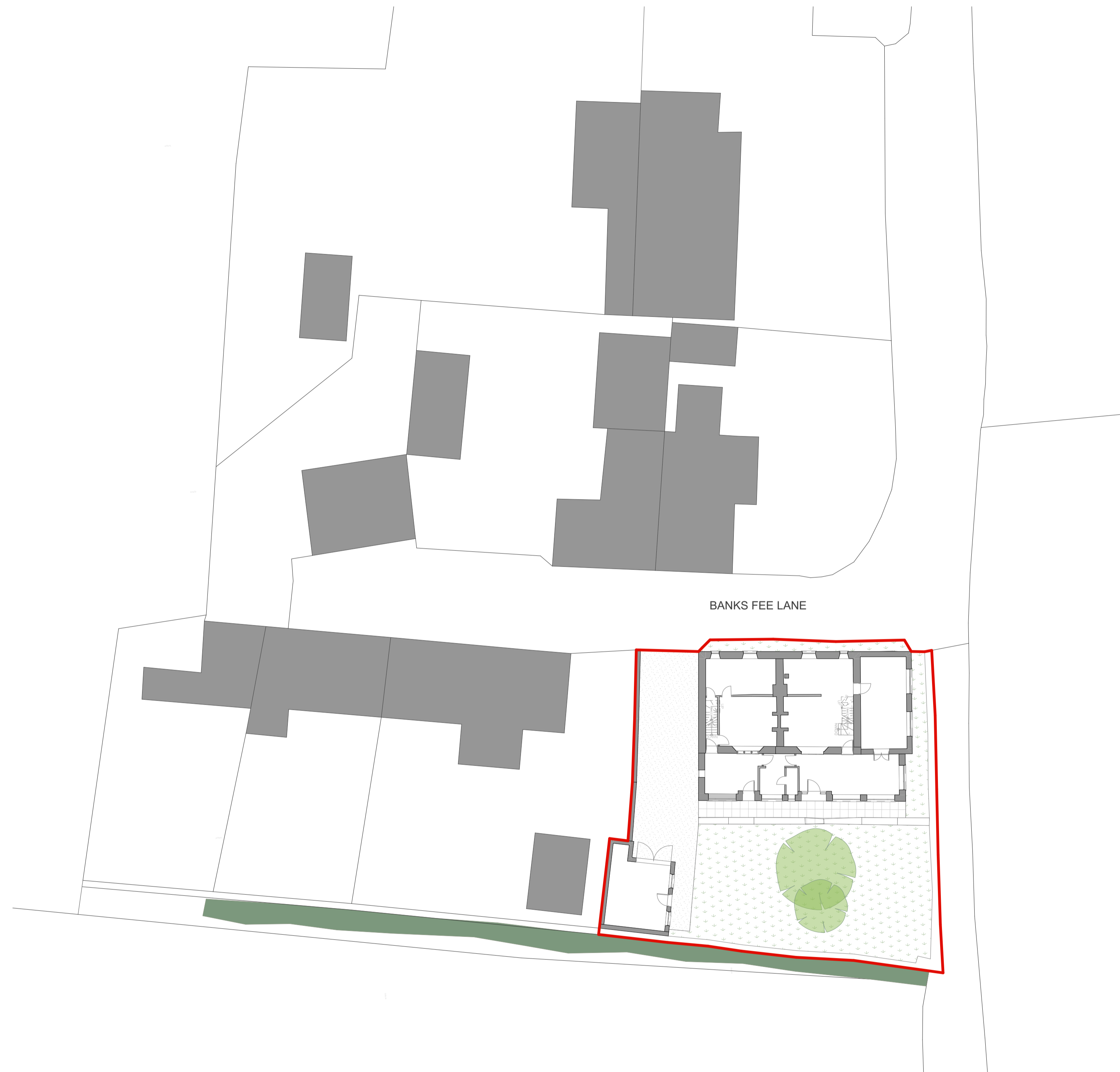
0. Existing Block Plan 1:200