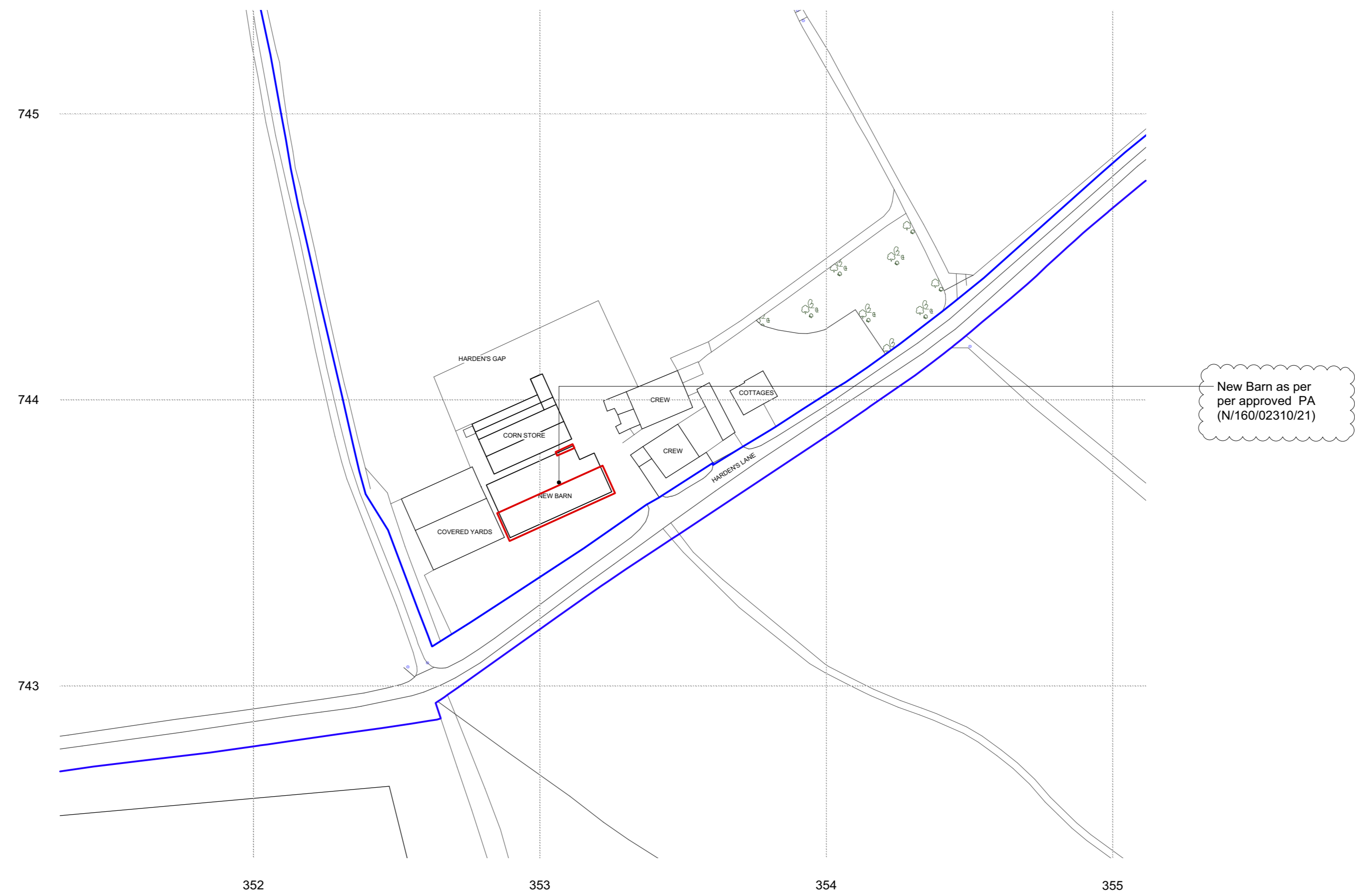
1 SITE LOCATION PLAN 1:1250(A1)/1:2500(A3)

Do not scale off this drawing. This drawing is to be read with all other contract documents. Any discrepancies are to be reported to the Architect. At construction status, this drawing remains design intent only. All information to be checked by contractor for site accuracy and fit. Drawings are subject to statutory approvals and site surveys.