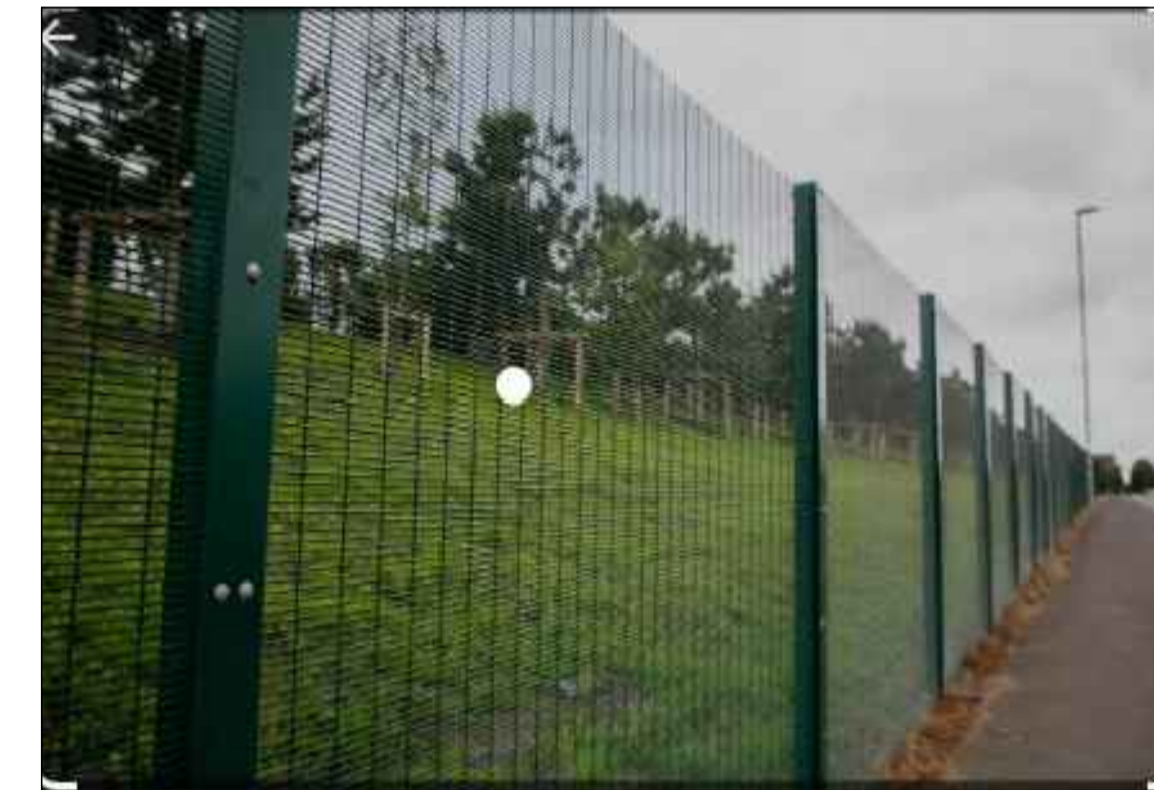
PROPOSED MESH SECURITY FENCE - TO MATCH EXISTING