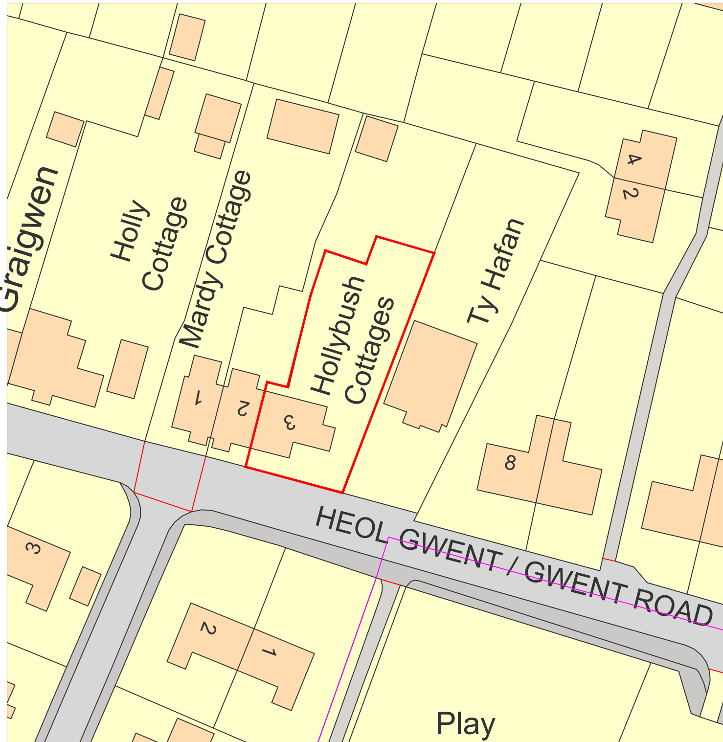
SITE LOCATION 1:500