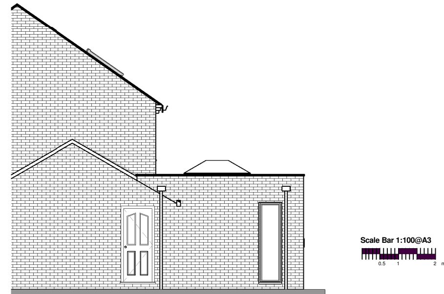
4 PROPOSED Side (North East) Elevation 1 : 100