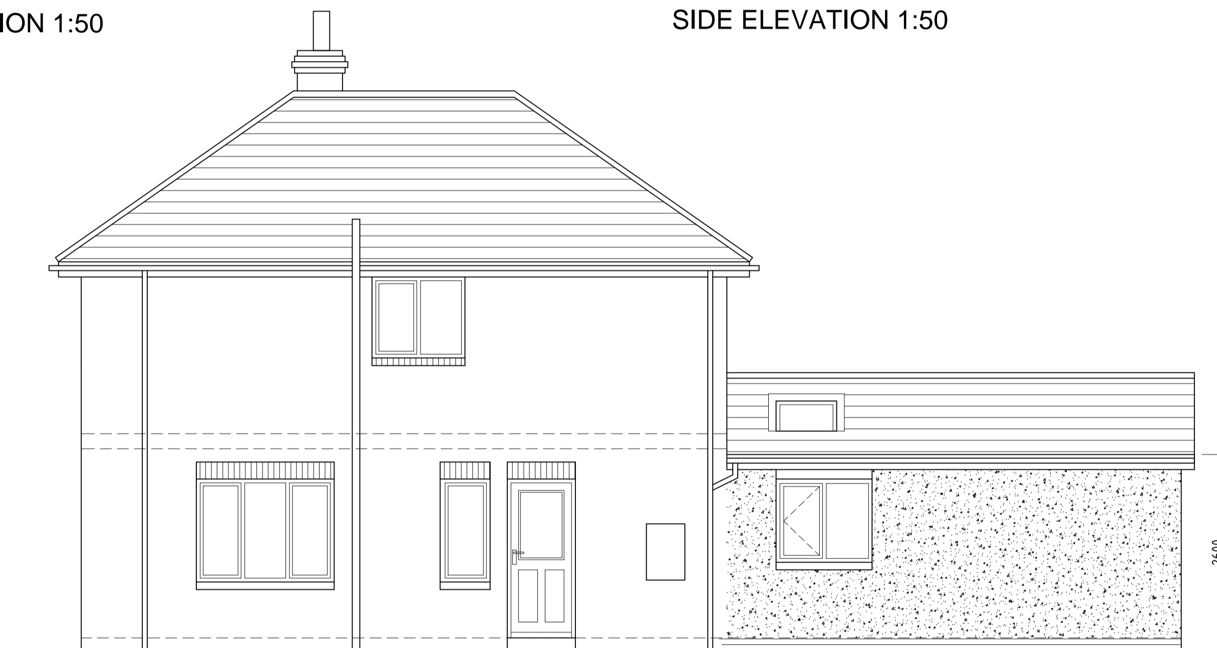
SIDE ELEVATION 1:50