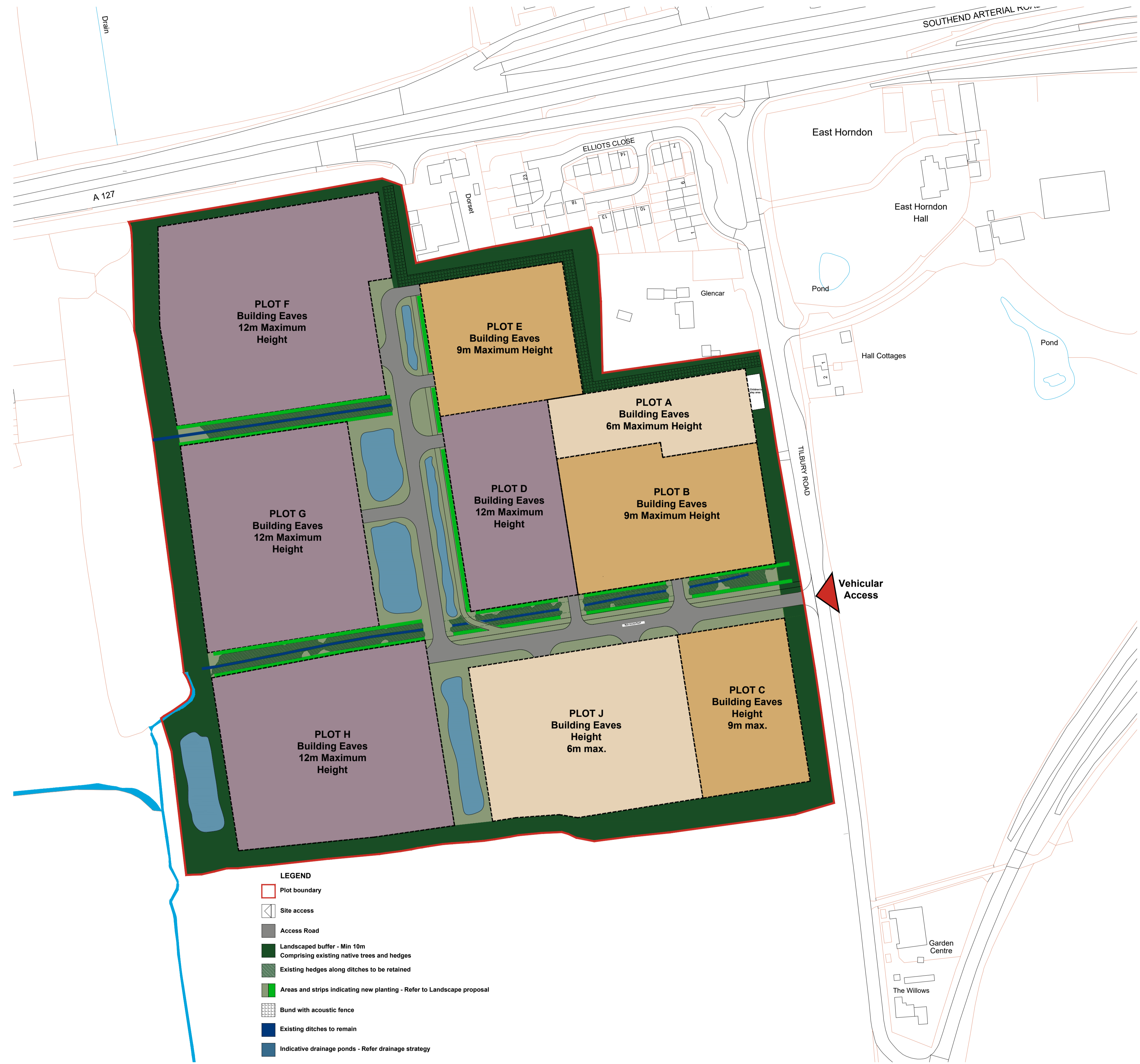
Indicative Plots and Landscape Parameters Plan scale 1:1250 @ A1

Notes: All setting out of work to be checked before work commences. Any errors to be reported to Nicholas Webb Architects before any further work is carried out. Work only to measured dimension, do not scale.