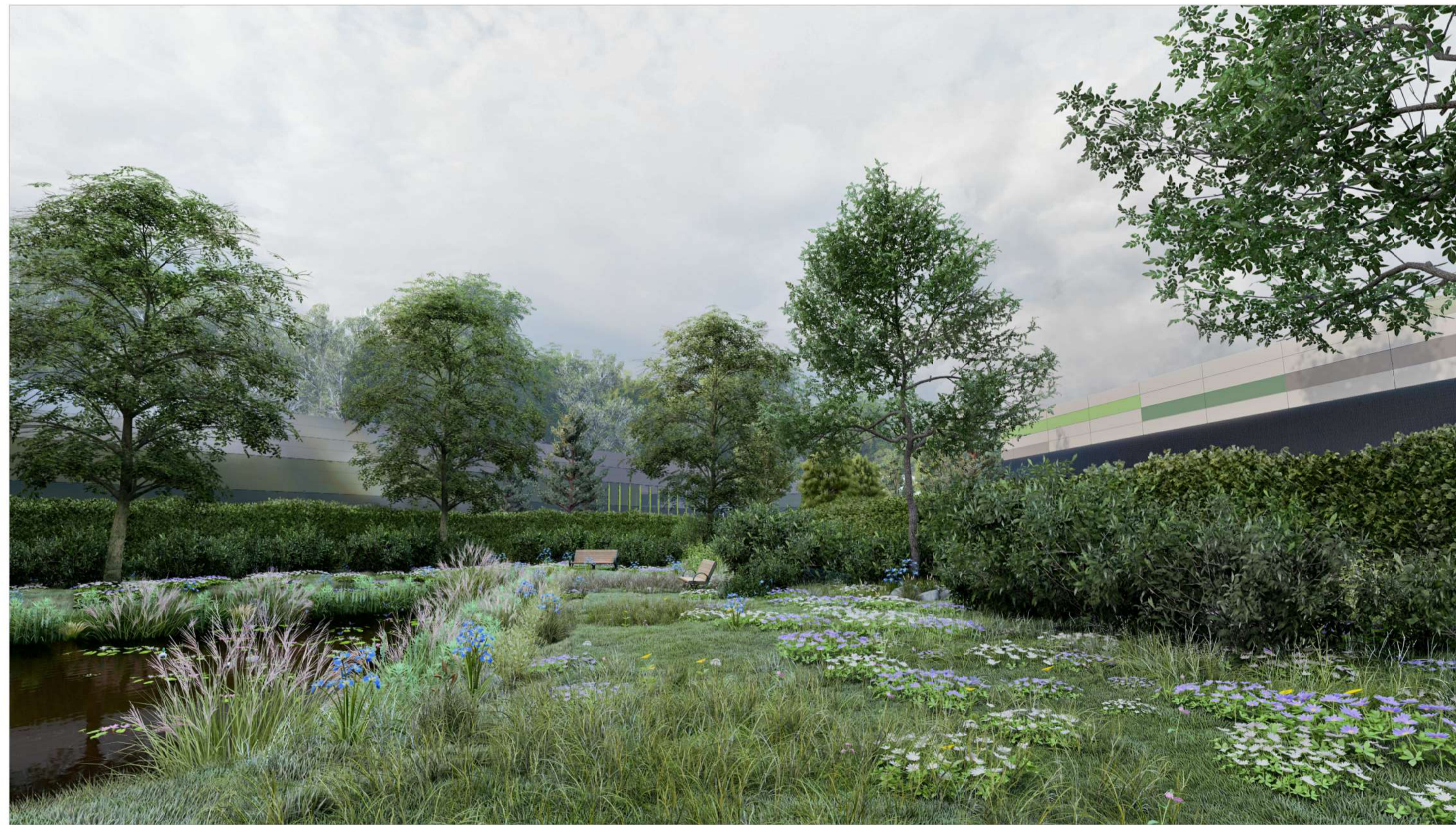
Viewpoint 3 - From pond area looking towards logistic buildings