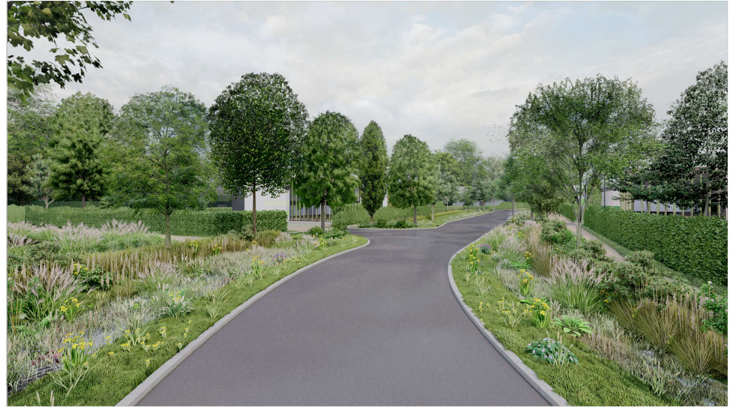
Viewpoint 2 - From Main Access Road looking west