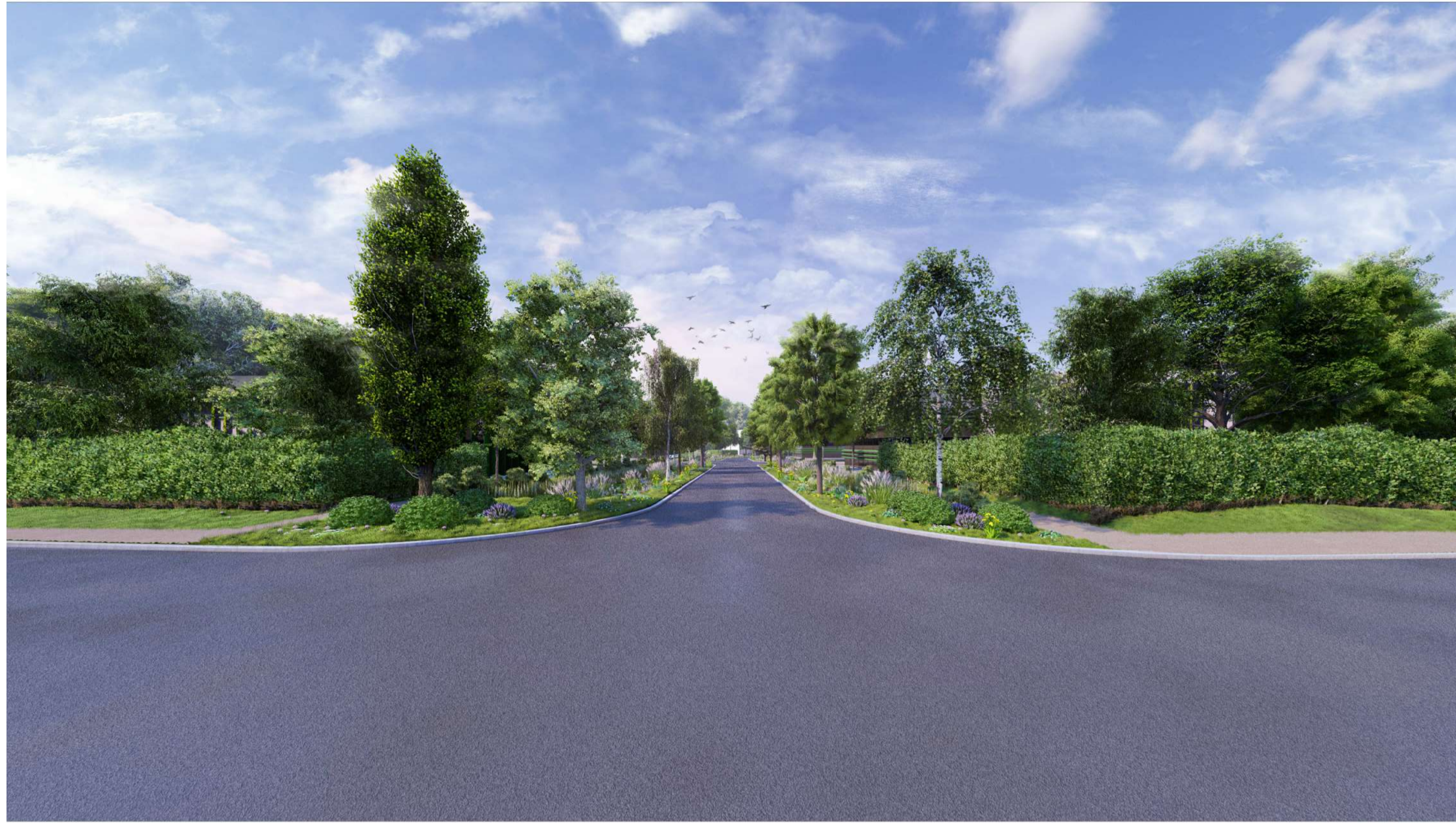
Viewpoint 1 - From Tilbury Road looking towards site entrance