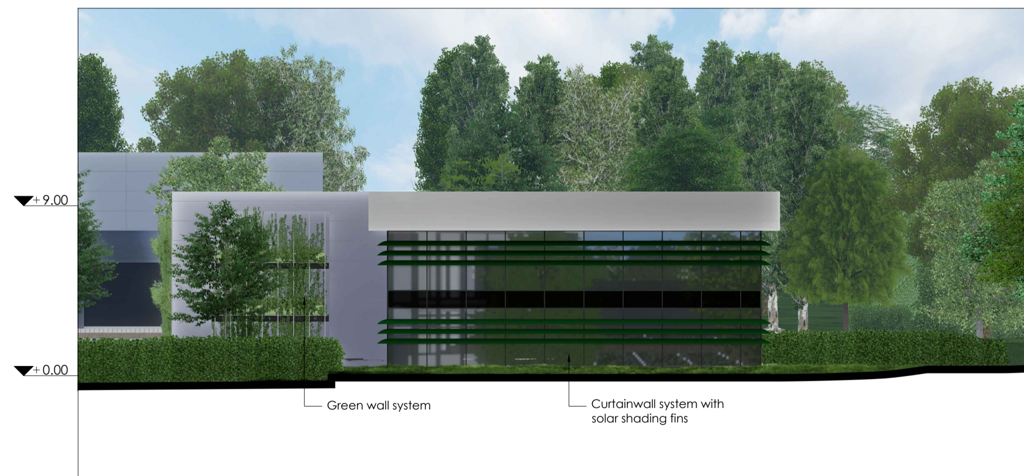
Typical 9m high building - South Elevation / Main Access Road scale 1:200 @ A1