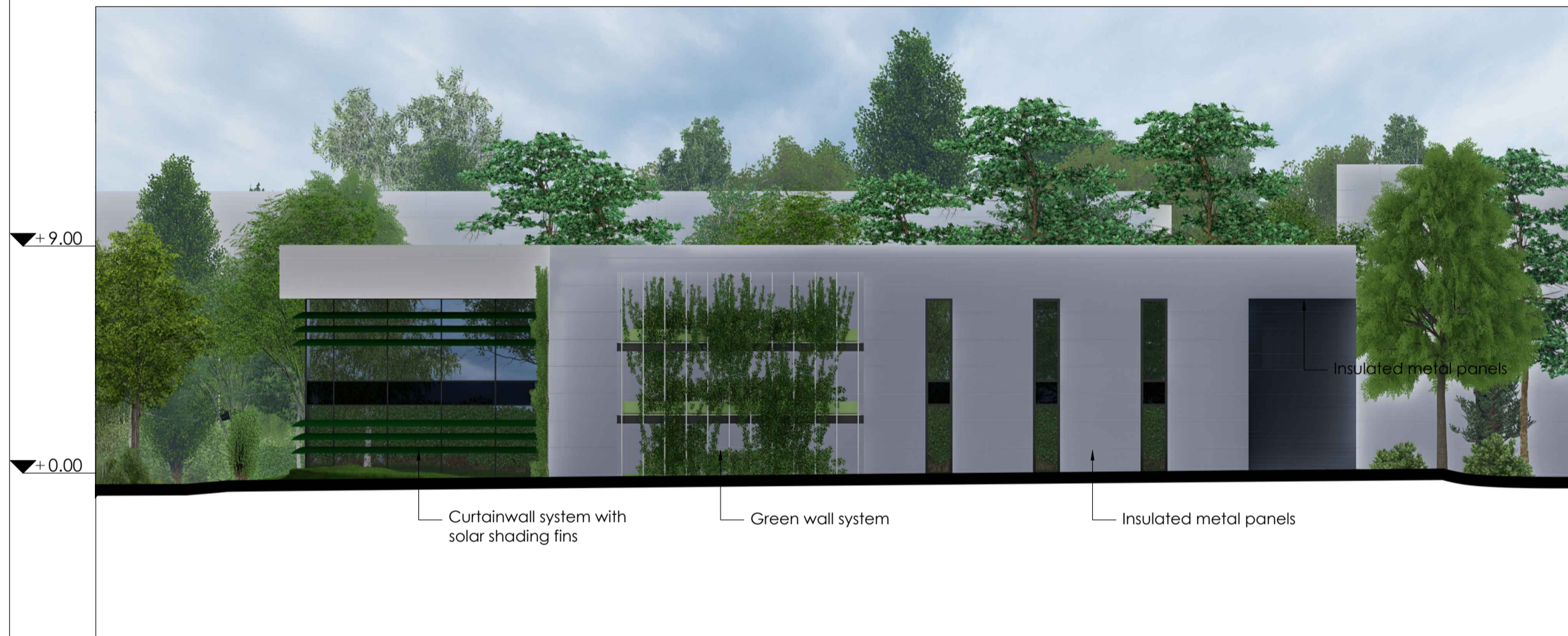
Typical 9m high building - East Elevation / Tilbury Road scale 1:200 @ A1