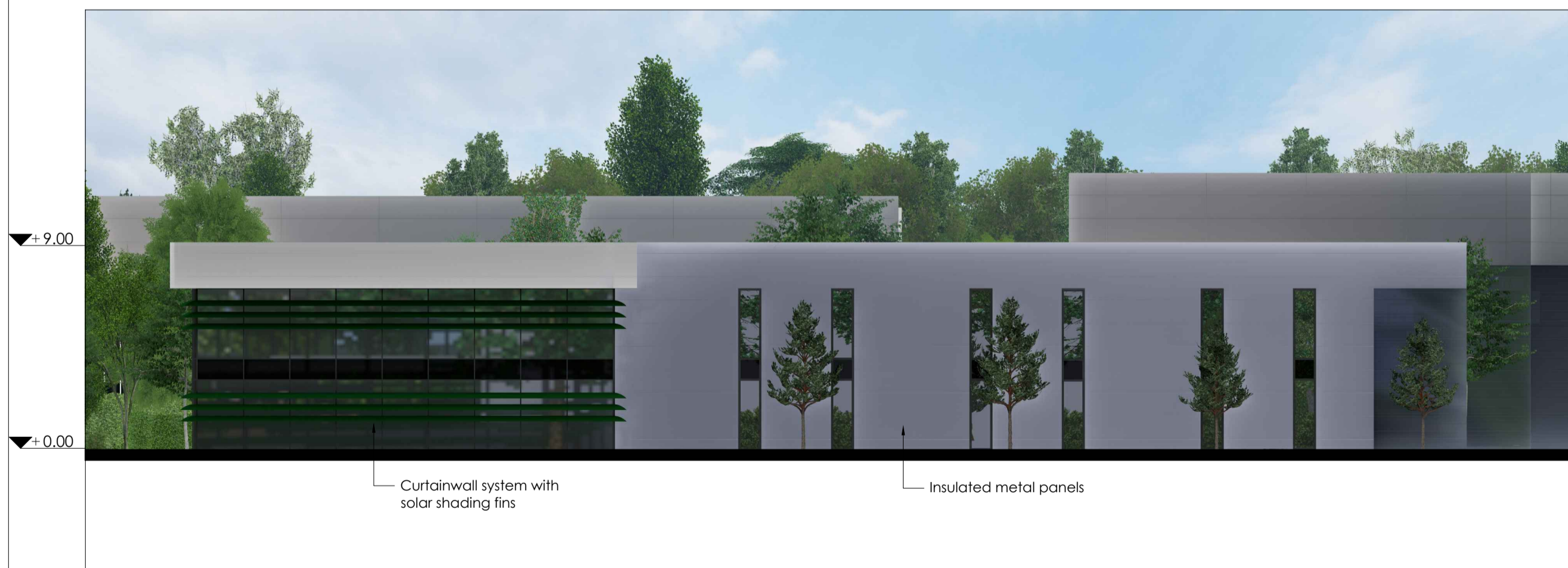
Typical 9m high building - West Elevation scale 1:200 @ A1