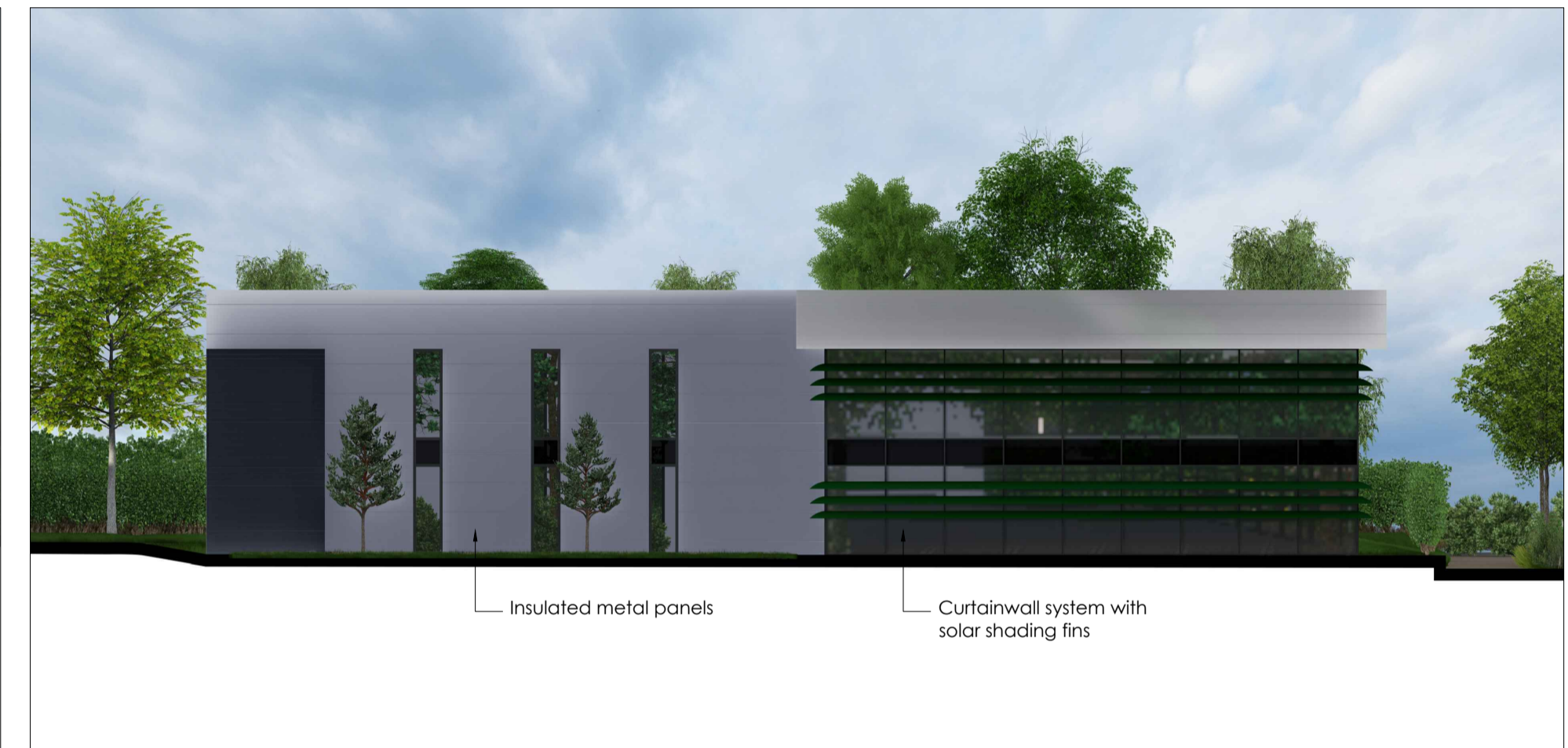
Typical 9m high building - West Elevation scale 1:200 @ A1