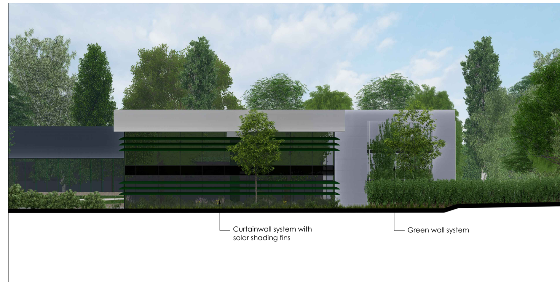
Typical 9m high building - South Elevation / Main Access Road scale 1:200 @ A1