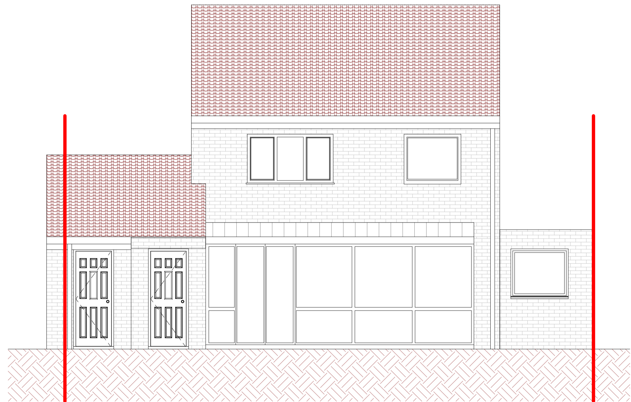
3 EXISTING EAST ELEVATION 1 : 50