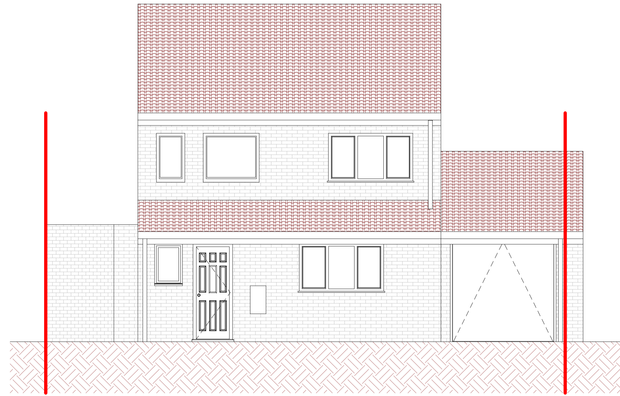
1 PROPOSED WEST ELEVATION 1 : 50