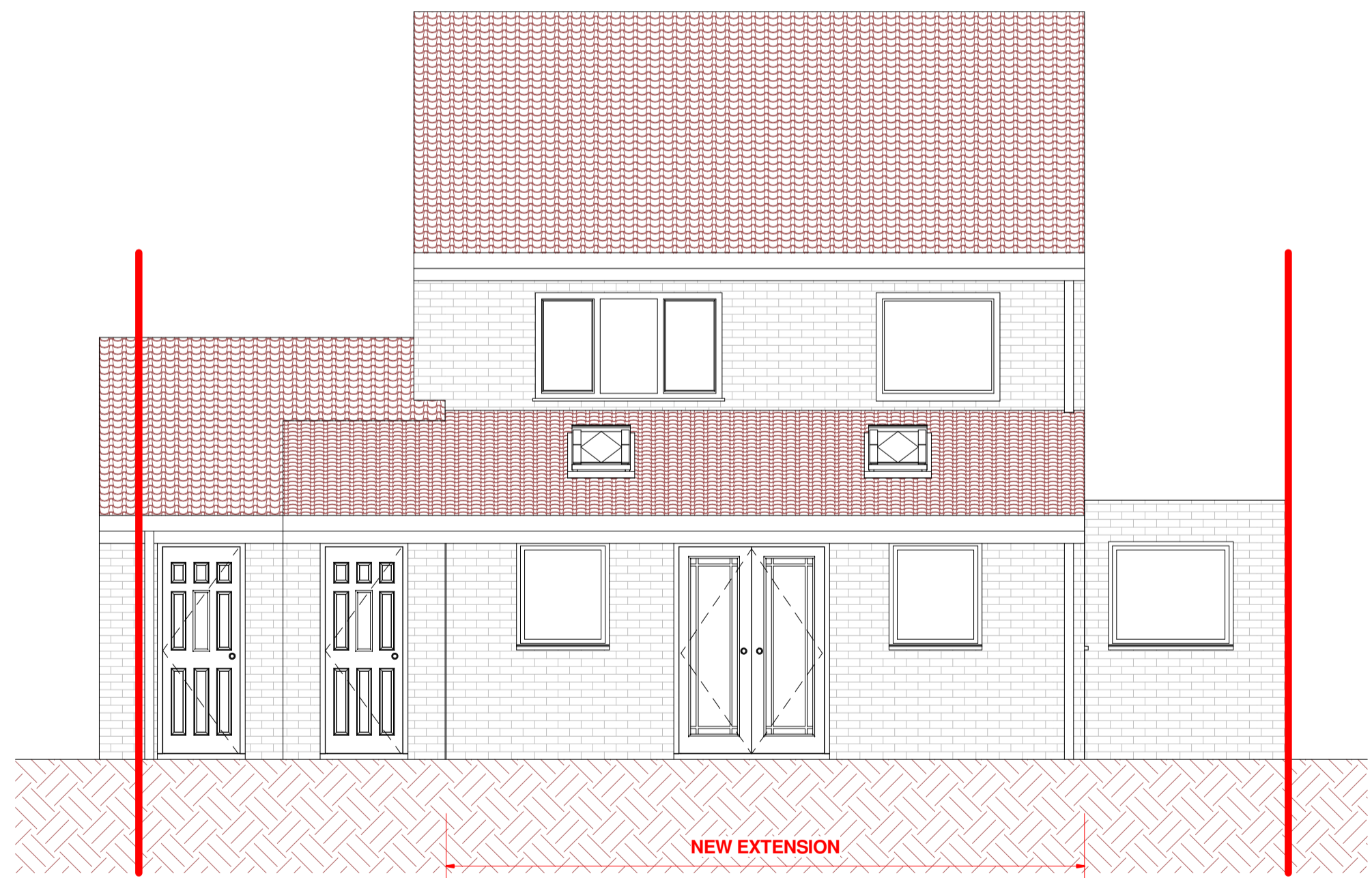
3 PROPOSED EAST ELEVATION 1 : 50