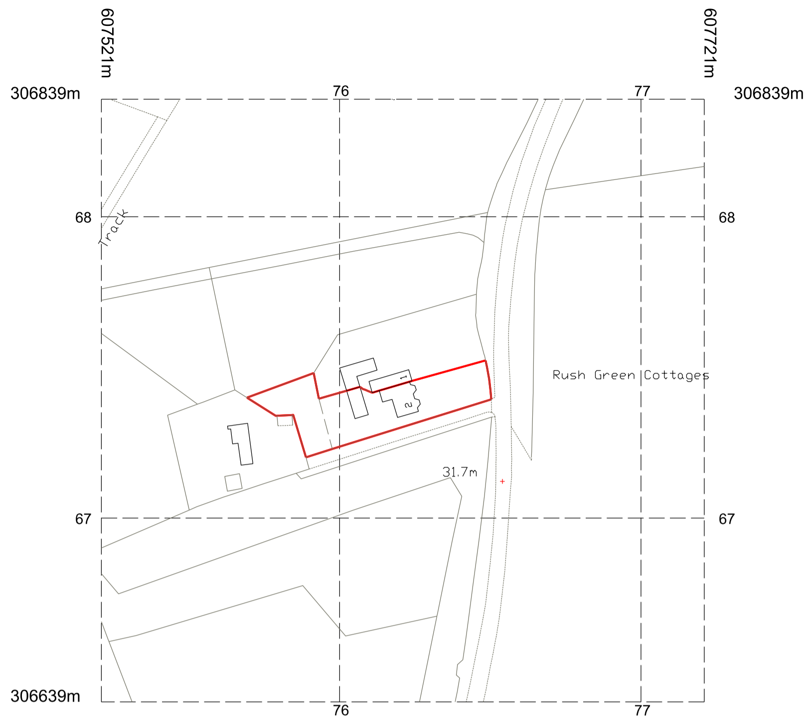
EXISTING SITE LOCATION PLAN 1:1250 @ A1